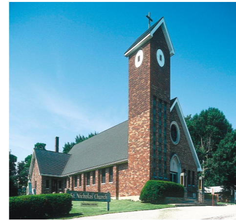
Saint Nicholas - Pocahontas

One thing that I learned throughout discernment is to put everything in the hands of God through our Blessed Mother. I have learned to trust in the desires of His Sacred Heart.