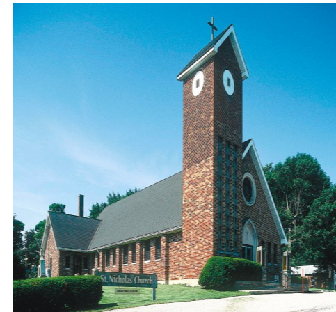
Saint Nicholas - Pocahontas