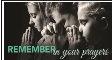
REMEMBER in your prayers

The St. Gertrude Altar Society meeting and dinner will be held Monday May 4th at 6:00pm at Blue Springs. All women of the parish are welcome and encouraged to attend. **Please note date change**