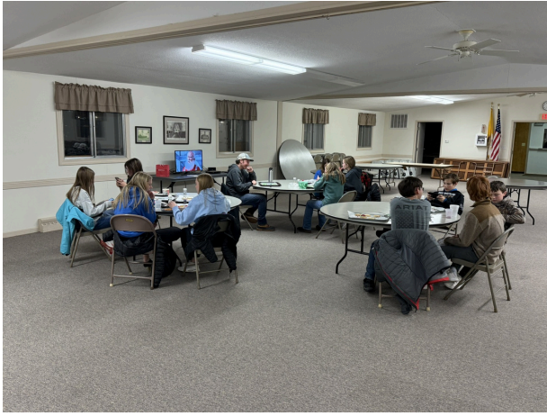
Youth Group movie and cookie decorating

The St. Felix Contemporary Choir will be singing special Christmas music before the 4:00 PM Mass on Christmas Eve. Plan to come early!