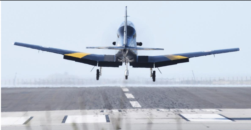
Landing on 19.