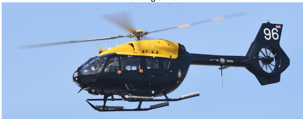
Jupiter HT.1 ZM496:96 202 Sqn 'WHIRLWIND206'