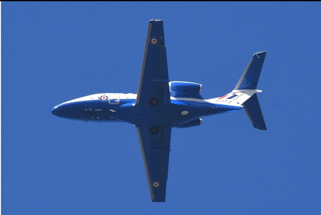
SRA on 19, high overshoot, then departed low level to the Mach Loop.