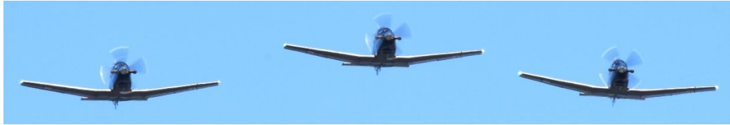
ZM340 ZM332 ZM330 'ROCKET1-3' at 11:20. Hawk T.2 4/25 Sqn