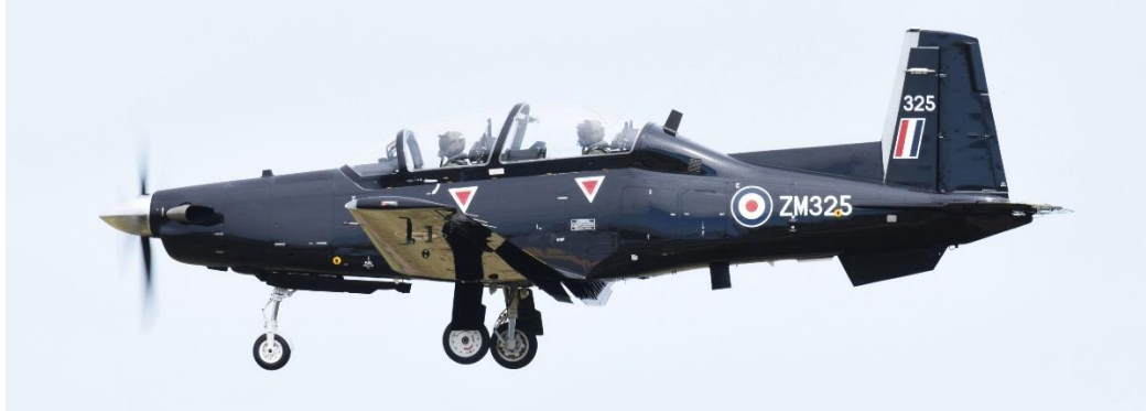
ZM325 'VYT71' air test, first flight since 24.9.25 ZM327 & ZM330 'SWIFT' visited Boscombe Down, returning same day. Jupiter HT.1 ZM496:96 202 Sqn