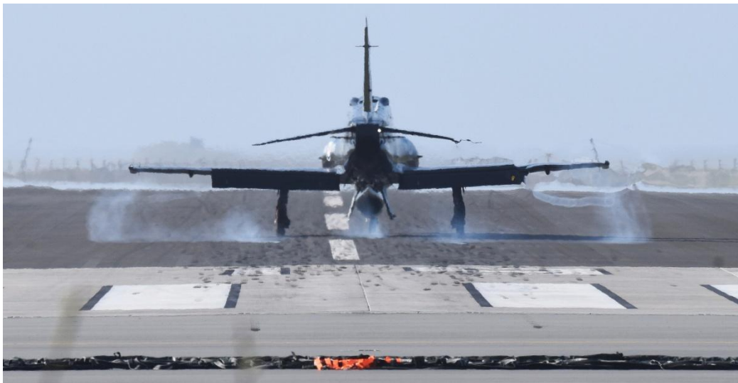
ZK029:FE landing on 19.