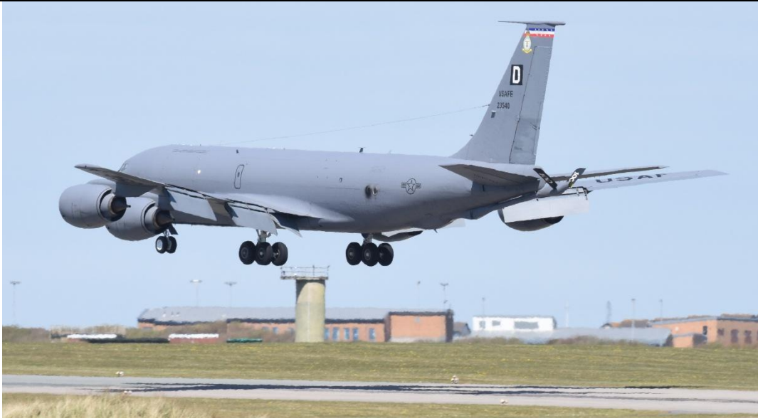
From Mildenhall, TACAN 31 via point 'Alpha' followed by a touch & go. It then flew a circuit with a low approach before departing to Yeovilton & Brize Norton for PD's.

ZK306 306 Typhoon FGR.4 [11 Sqn] 'TYPHOON45' PD at 14:32