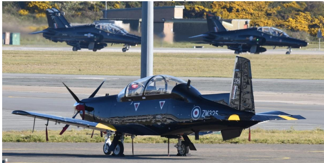
Texan T.1 ZM325 72 Sqn Hawk T.2 ZK011:B 4/25 Sqn

Based noted: Hawk T.2 4/25 Sqn ZK011:B ZK012:C ZK013:D ZK024:O ZK025:FA ZK029:FE ZK031:FG ZK034:FJ Texan T.1 72 Sqn