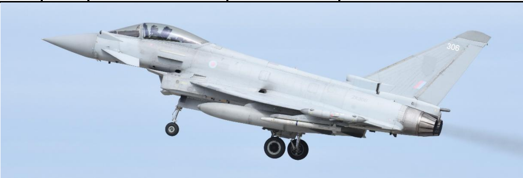
From Coningsby, PAR 31 low approach then departed to the South low level.

ZK306 306 Typhoon FGR.4 [11 Sqn] 'TYPHOON45' PD at 14:32