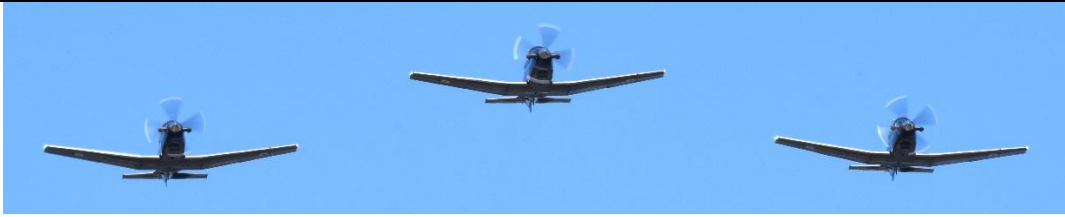
ZM327 ZM343 ZM324 'SWIFT1-3' at 11:19.