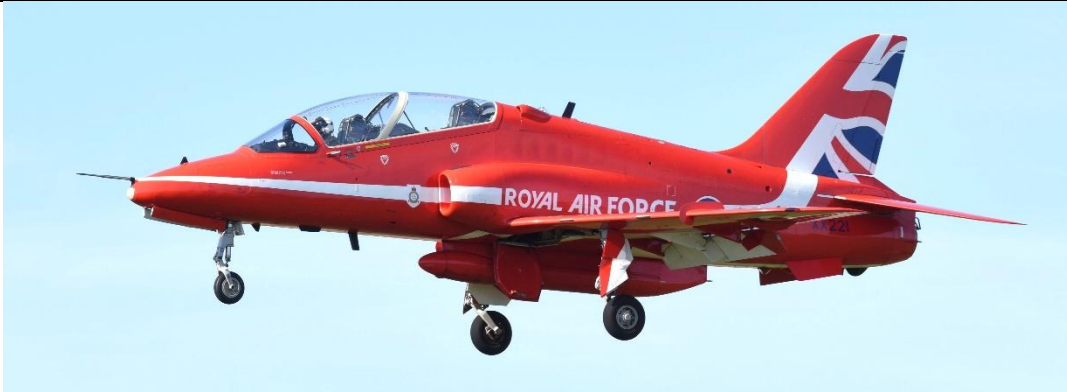
Arrived from Waddington at 10:19 & departed back there at 17:15