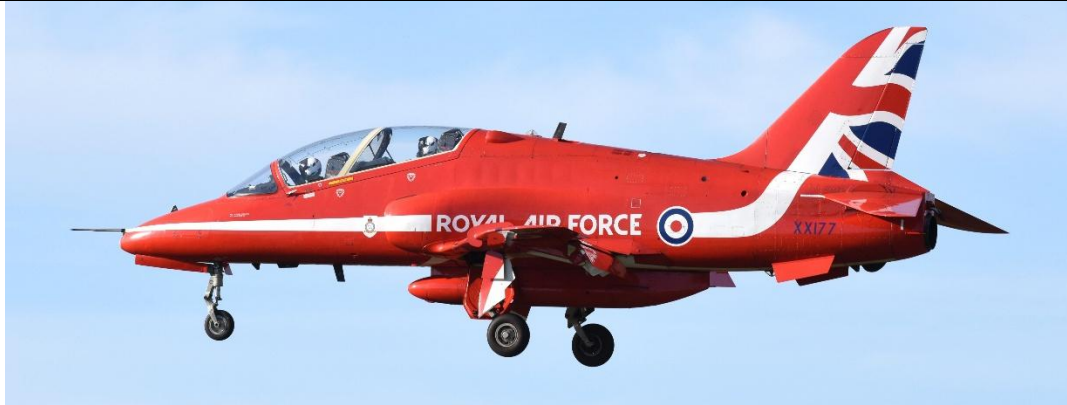
Arrived from Waddington at 08:52 & departed back there at 12:25.