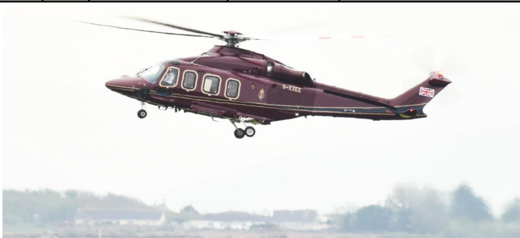
HRH Prince of Wales arrived at & departed back at 14:05. [TKK – The King's Helicopter Flight] Arrived via Runway 01.