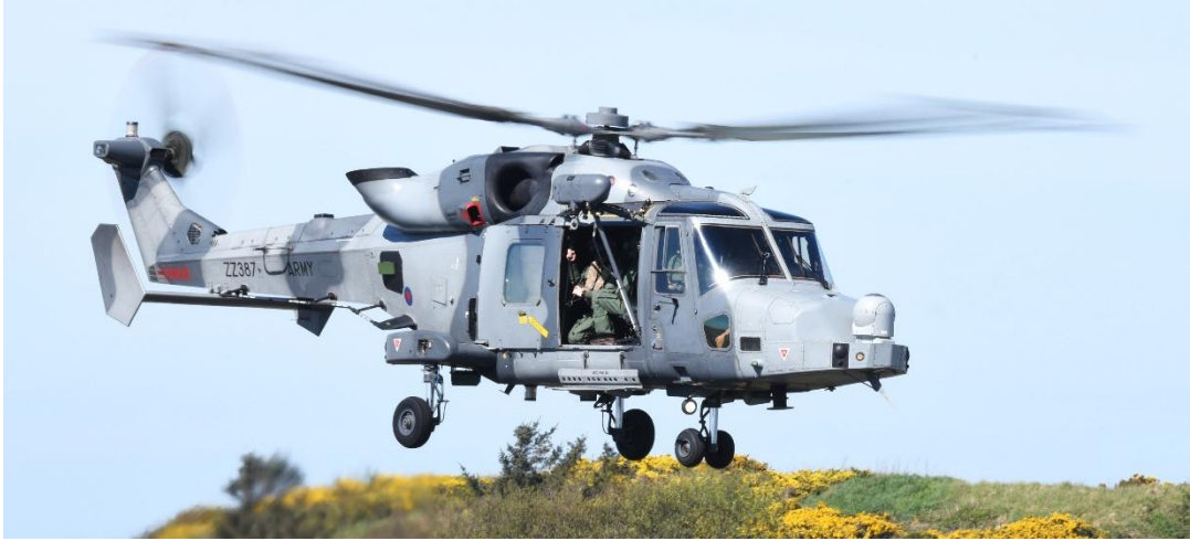
Departed back to Yeovilton at 10:42 via Runway 01 & East Gate.