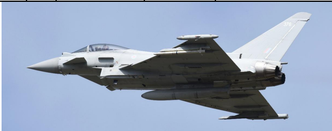
From Coningsby, PAR 31 high approach then departed to the South low level.

ZK376 376 Typhoon FGR.4 [11 Sqn] 'TYPHOON46' PD at 14:39