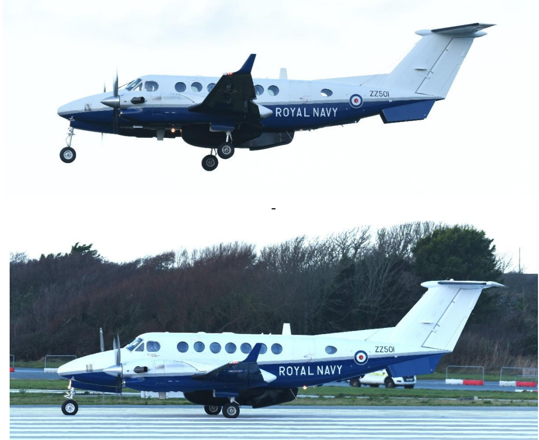
Arrived from Culdrose at 09:22, engines running and dropped off 2 passengers. Departed back to Culdrose at 09:44.

20-5608 LN F-35A 493 FS/48 FW 'CHAIN91' PD at 13:39