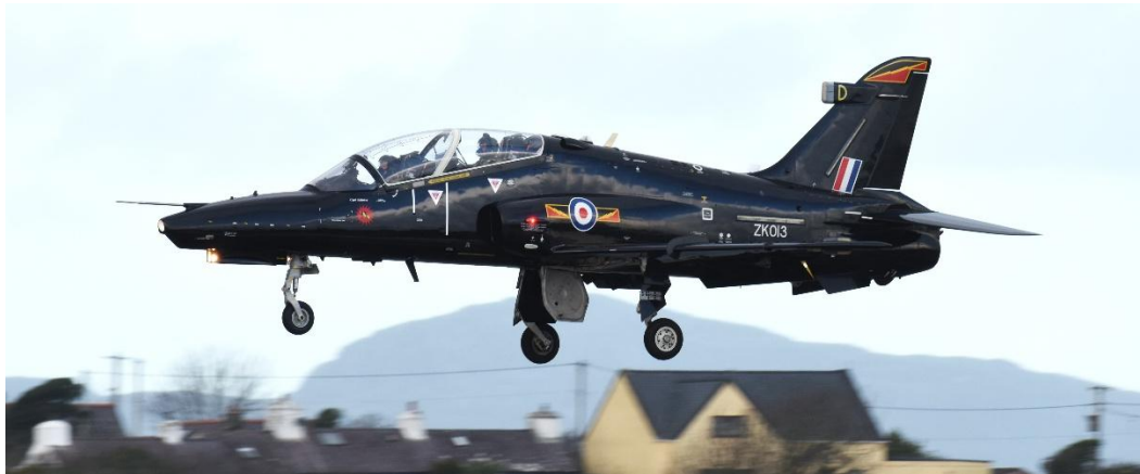
ZK013:D 'VYT15' air test.

ZK011:B ZK012:C ZK013:D ZK018:I ZK019:J ZK020:K ZK022:M ZK034:FJ ZK035:FK