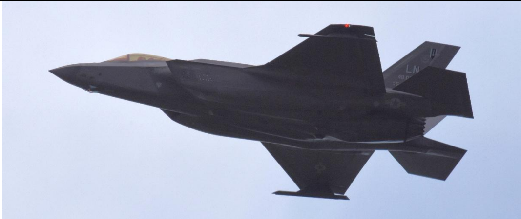
Very high approach on 19.