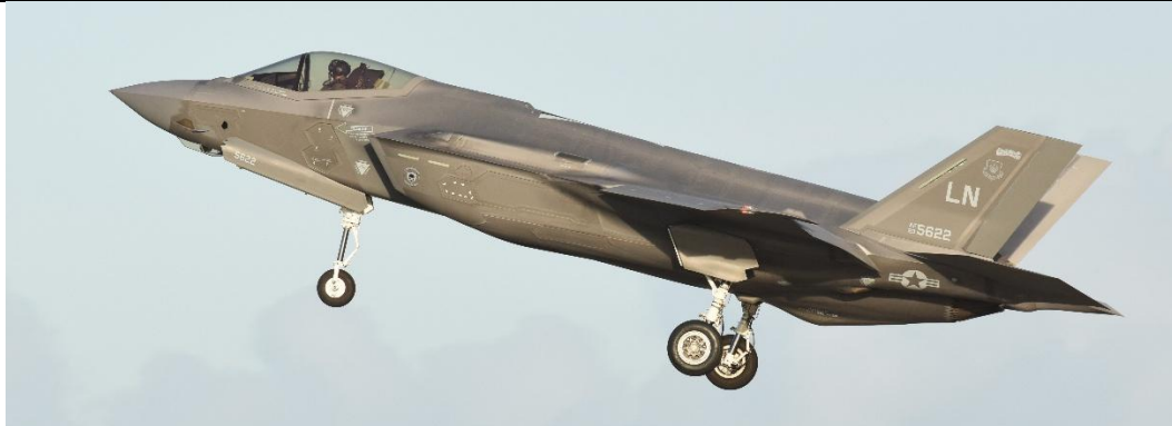
[ex. 34 FS/388 FW 'HL']

Mach Loop then TACAN to 31 then GH in the NWMTA before returning to Lakenheath.