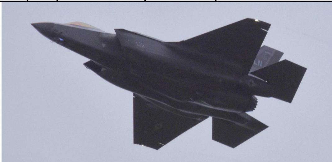
Very high approach on 19. Both were to & from Lakenheath with no low level.

20-5608 LN F-35A 493 FS/48 FW 'CHAIN91' PD at 13:39