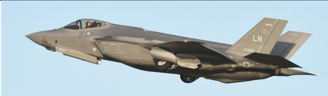
Same as the above. [orange bone dome with 'Dutch' inscribed]