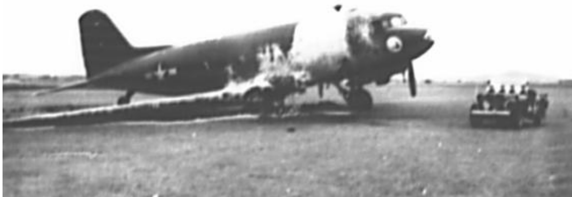
Holyhead Mountain can be seen in the right background.