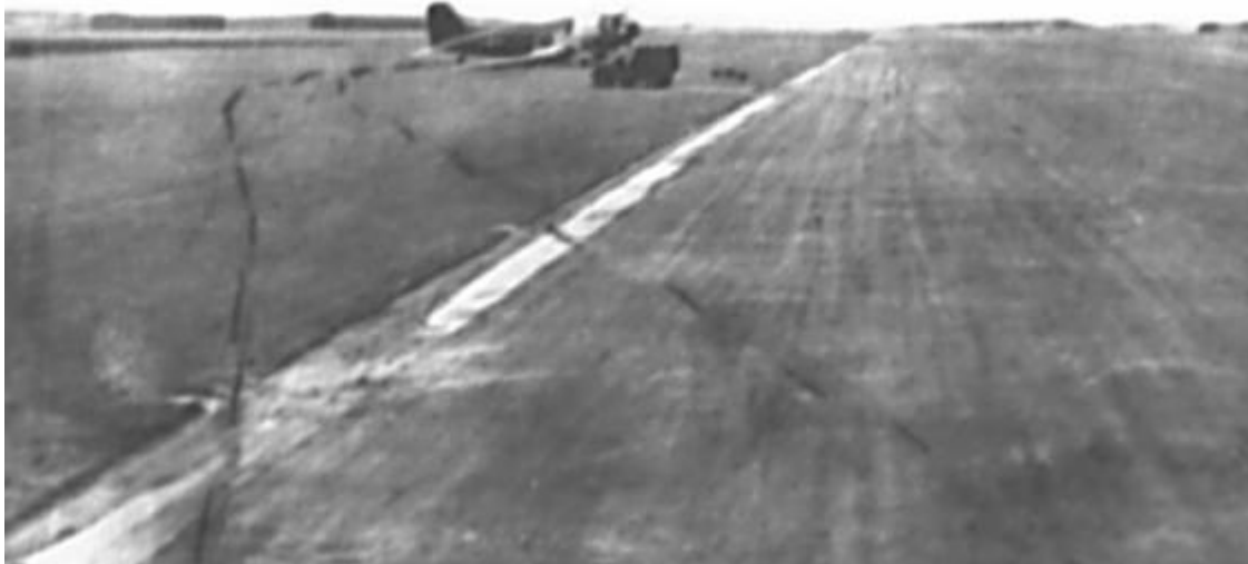
Here seen on 32 with the 'beach' side hangars in the left background.