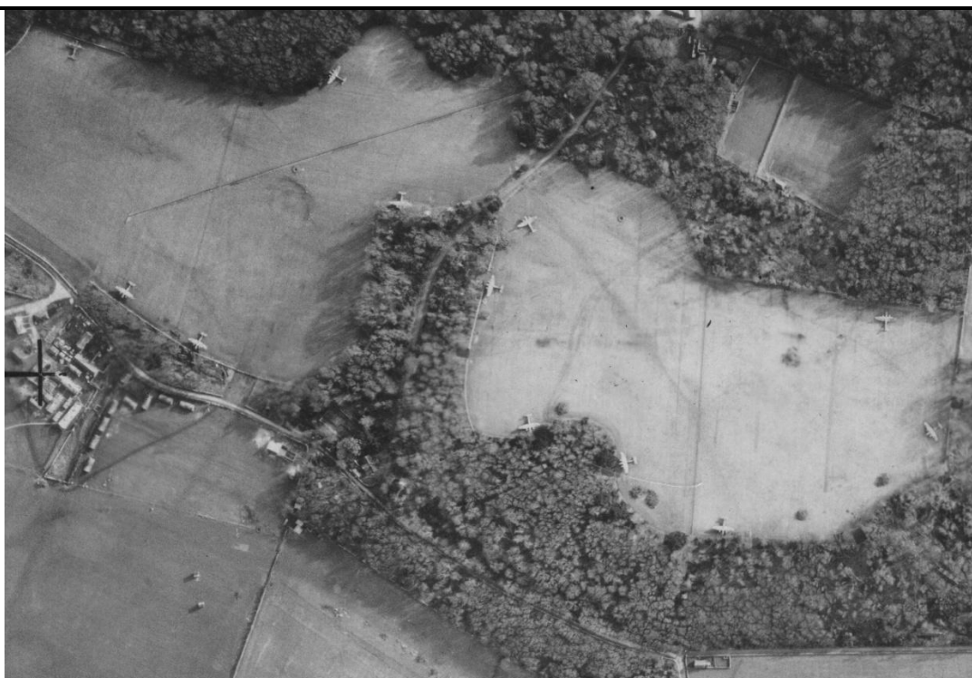
These undated images show Bothas in external storage in the grounds of the Estate.