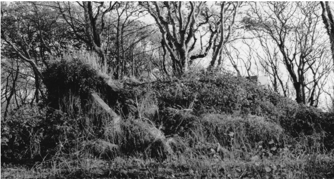
Overgrown Air Raid shelter.