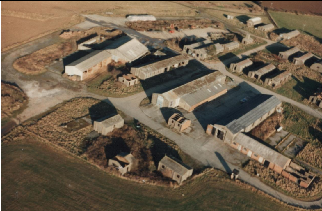
The Domestic Site seen from the air.