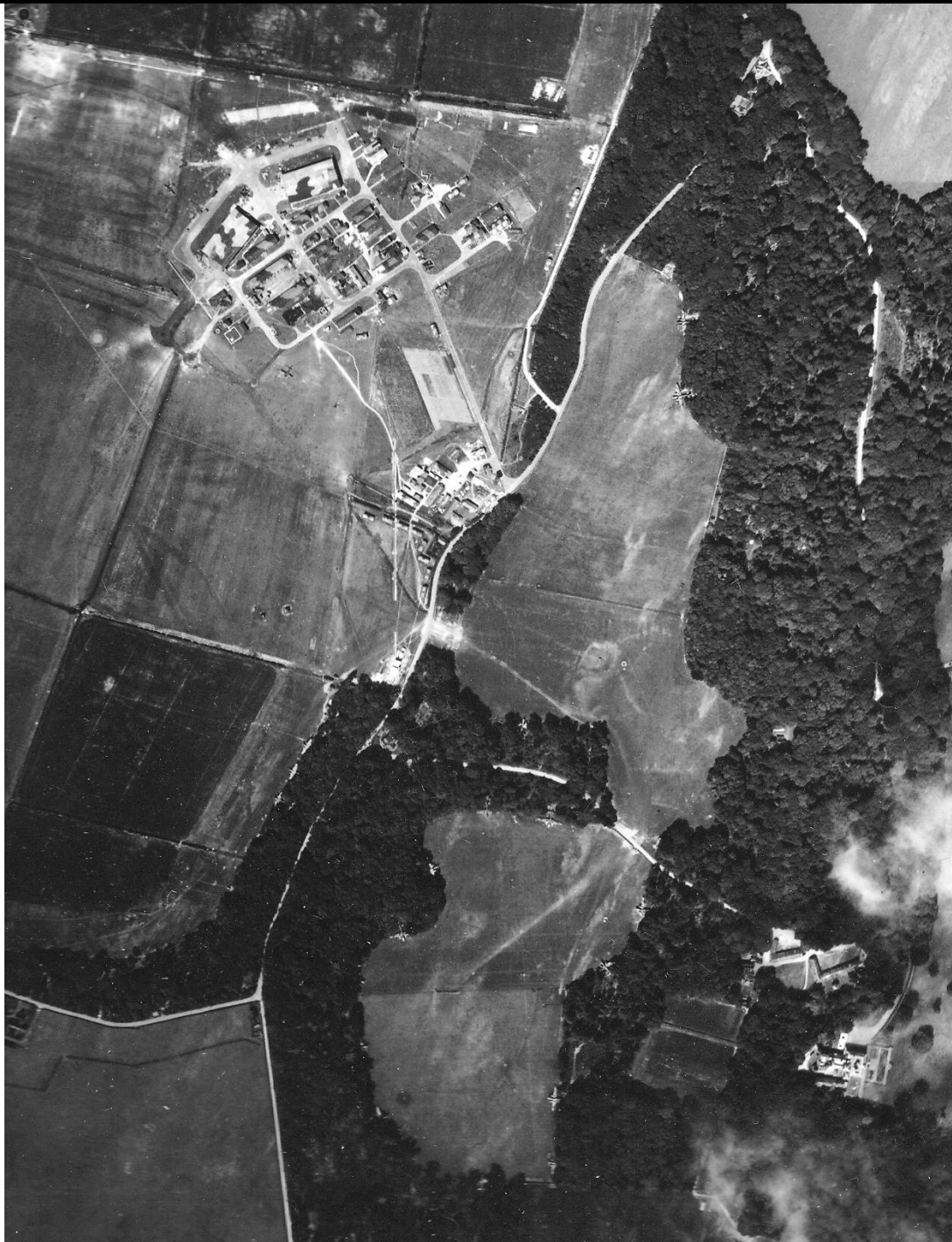
This undated image shows Wellingtons in external storage on the Estate.

Friday 1 st May 1942 [AIR 28/88][AIR 29/42][AIR 29/41][AIR 29/39]