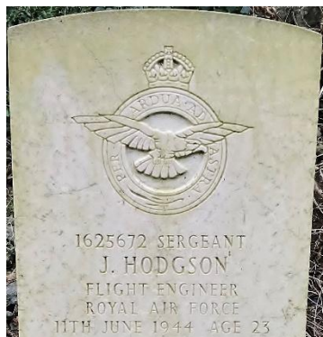
Llangadwaladr Church

first sortie on the Sqn having only arrived at midday the previous day. He and the Pilot [buried at Brixham] were the only bodies recovered, the remaining crew members are commemorated on the Runnymede Memorial.