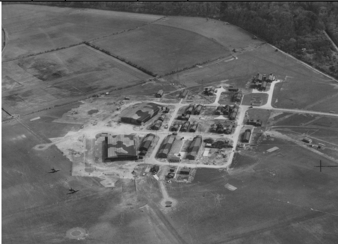
Although undated, this shows the 2 Battle aircraft on the left of the photograph. They were both at Bodorgan Jan-Jul 1943.