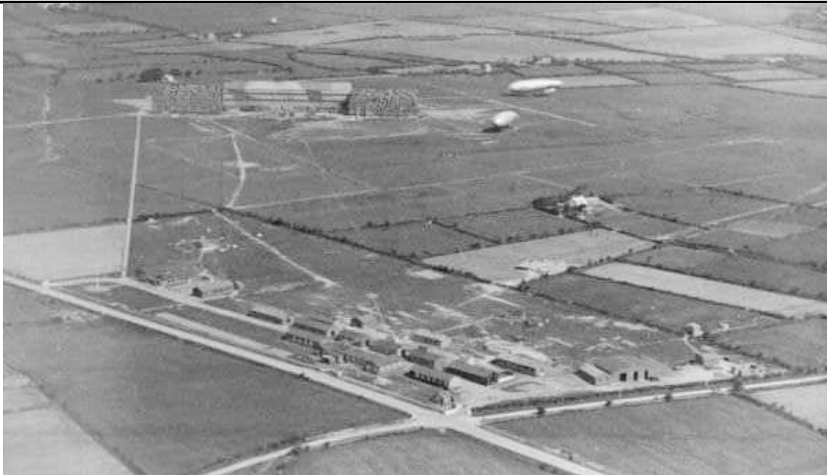
Looking to the North West, the A5 can be seen lower left & right.