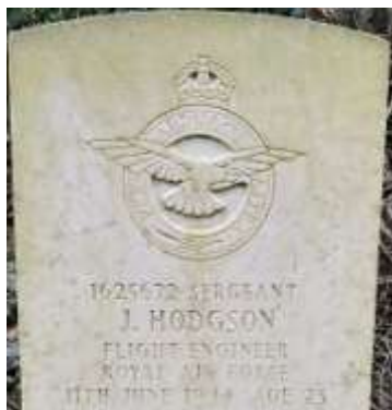
Llangadwaladr Church