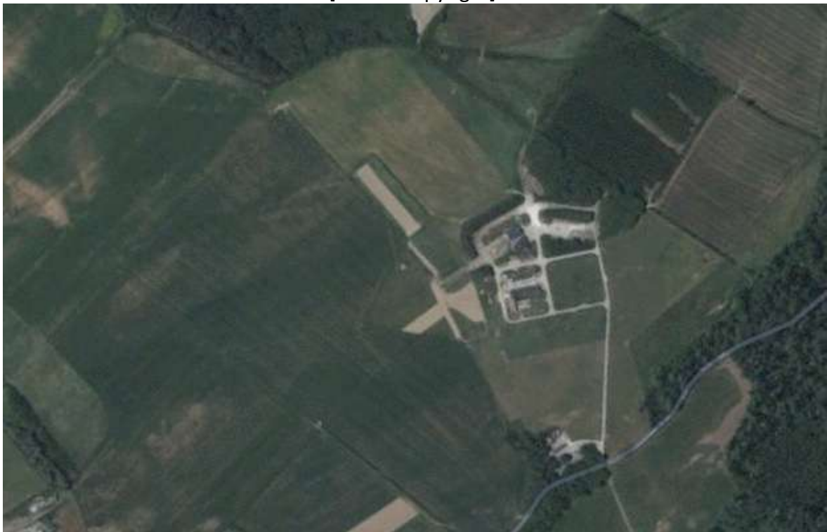
Aerial view in 2023