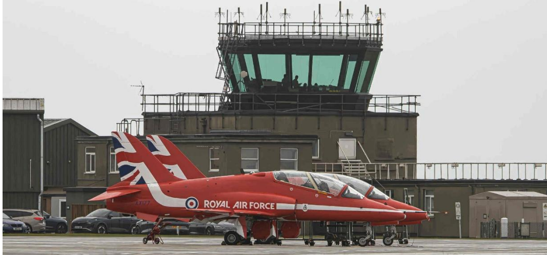
[Iwan Pritchard] XX177 with XX219 behind on ASP.1

XX219 - Hawk T.1A RAFAT 'RED10' at 11:02 ASP.1