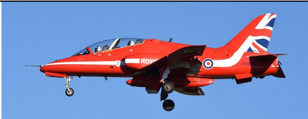
Note missing foot door panel below the cockpit. Arrived from Waddington at 12:51 & departed back at 16:04

Based noted flying: Hawk T.2 4/25 Sqn ZK011:B ZK012:C ZK013:D ZK018:I ZK019:J ZK020:K ZK021:L ZK025:FA ZK034:FJ ZK035:FK