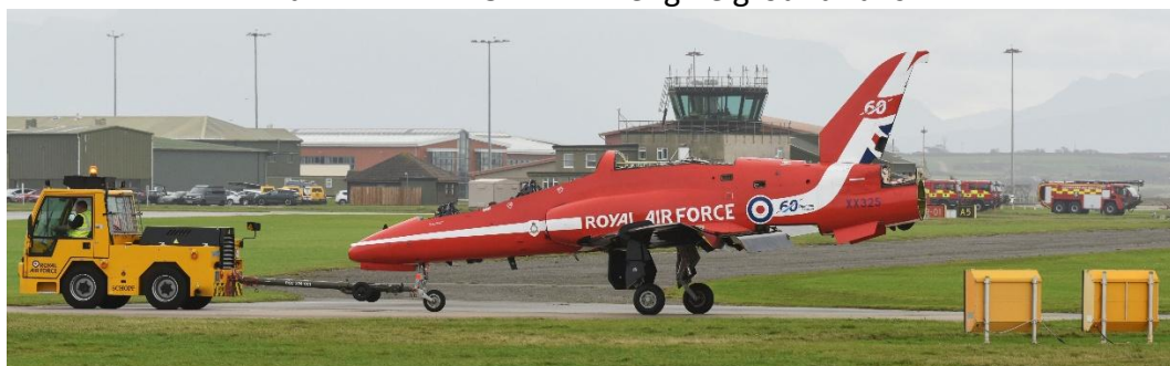
Hawk T.1A XX325 ex.RAFAT towed from the storage hangar to Gaydon hangar. Hawk T.2 4/25 Sqn