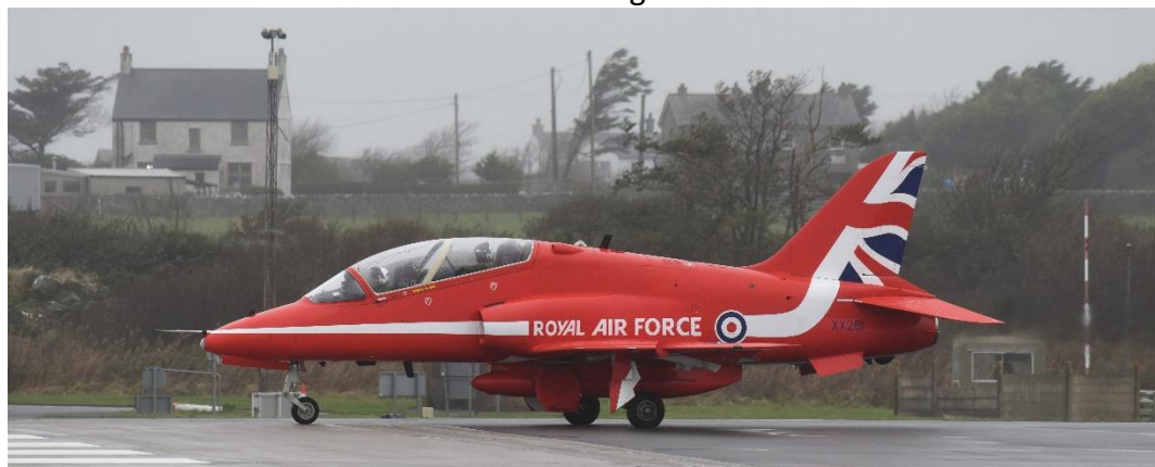
Departing as 'RED6'

Arrived from Waddington as 'RED7' at 09:06 & departed back at 12:08 as 'RED6'