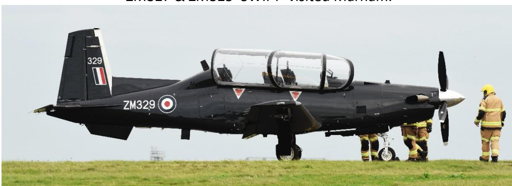
ZM329 'CORDITE1' Crew evacuated the aircraft at the 13 holding point due to smoke from the engine.