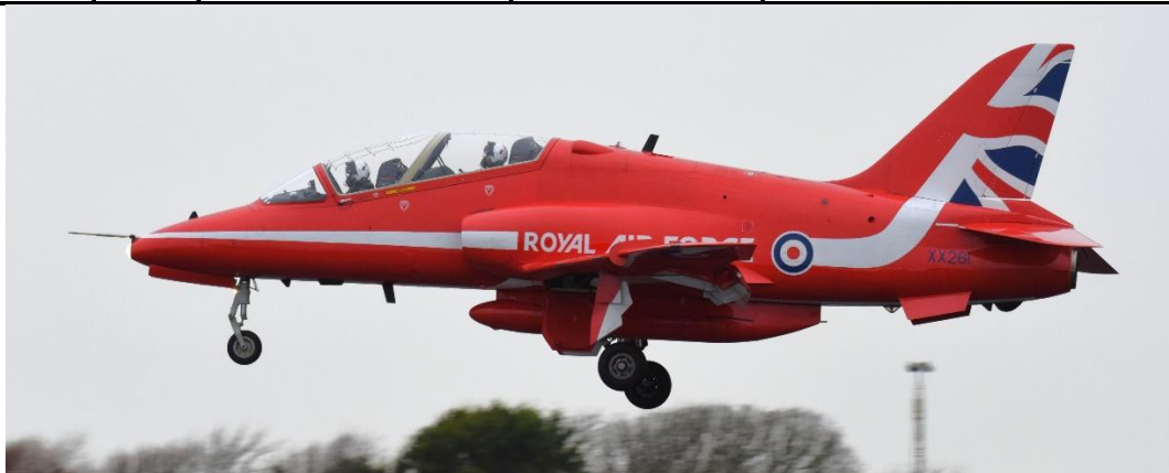
Seen here arriving as 'RED7'