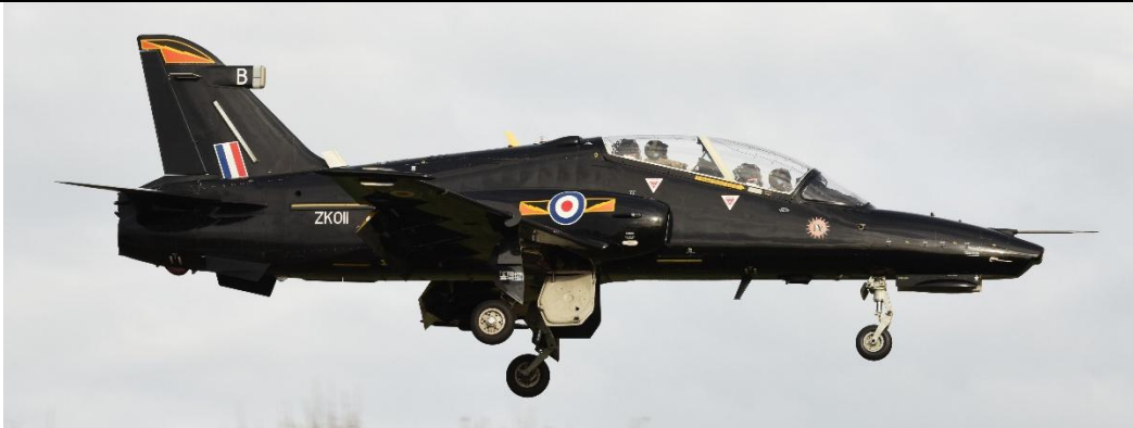
ZK011:B 'VYT53' air test. Texan T.1 72 Sqn ZM327 & ZM323 'SWIFT' visited Marham.