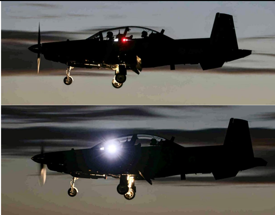
Hawks & Texans night flying.