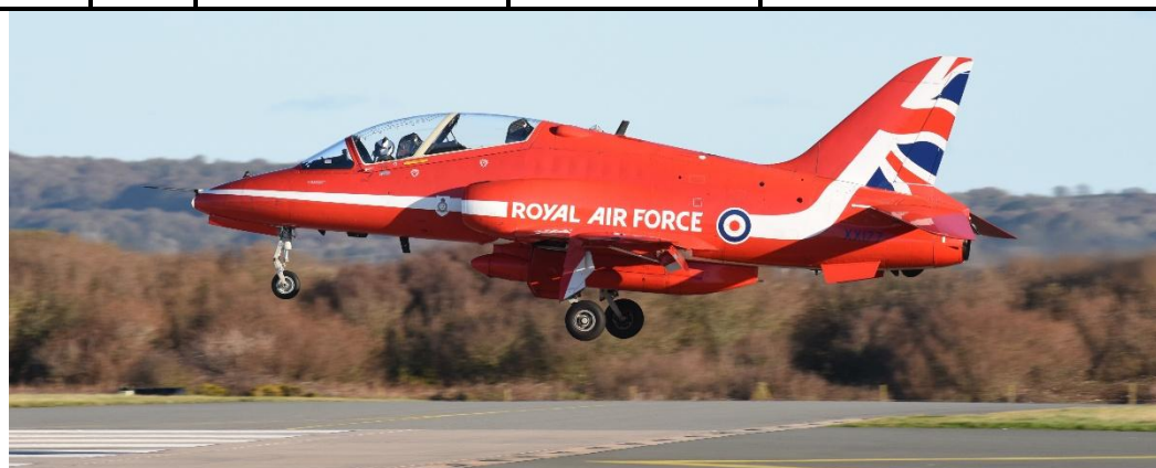
Arrived from Waddington at 10:02 & departed back at 13:05