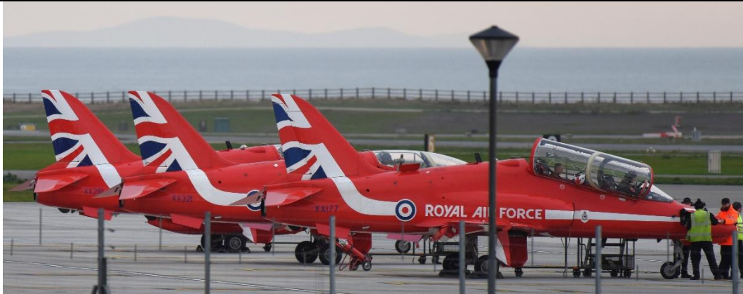
Left to right on ASP.1 – XX261 XX321 XX177. XX261 ground run then departed from AMRO at 16:09 to RAF Waddington.