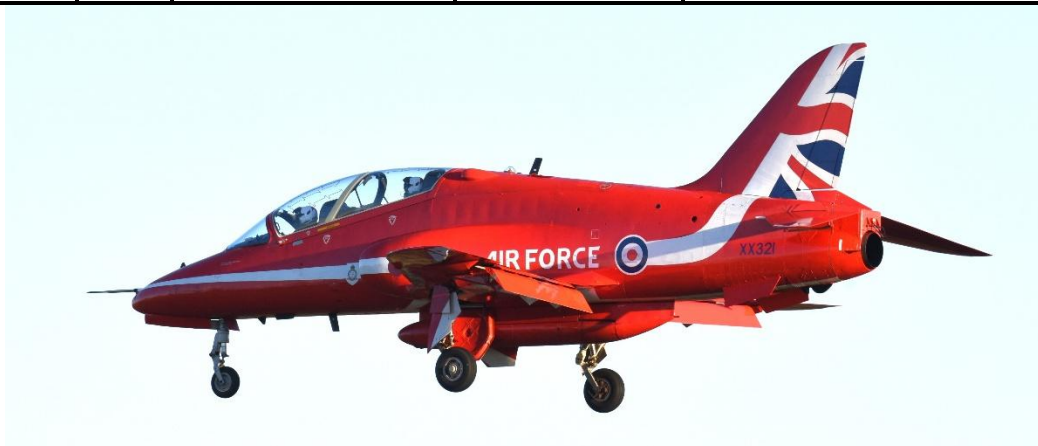
Arrived as 'RED4'