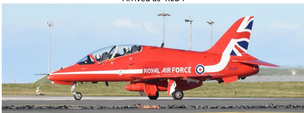
Arrived at 09:09 from Waddington & departed back at 12:15 as 'RED5'