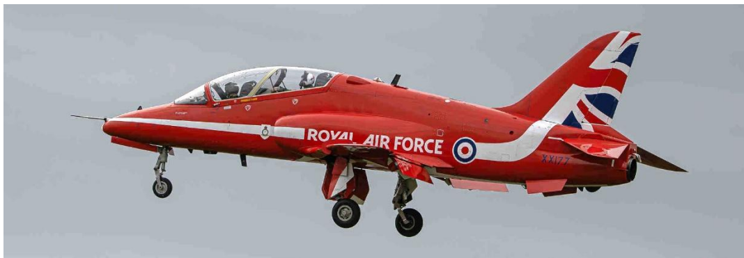
[Iwan Pritchard] Hawk T.1 XX177 RAFAT 'RED10' air test 12:58-13:18. [returned early due to pressurisation problems] Texan T.1 72 Sqn ZM328 'VYT61' & ZM341 'VYT71' returned from Lossiemouth, see 4.11