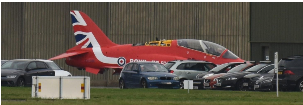
Hawk T.1A XX281 RAFAT engine ground runs.