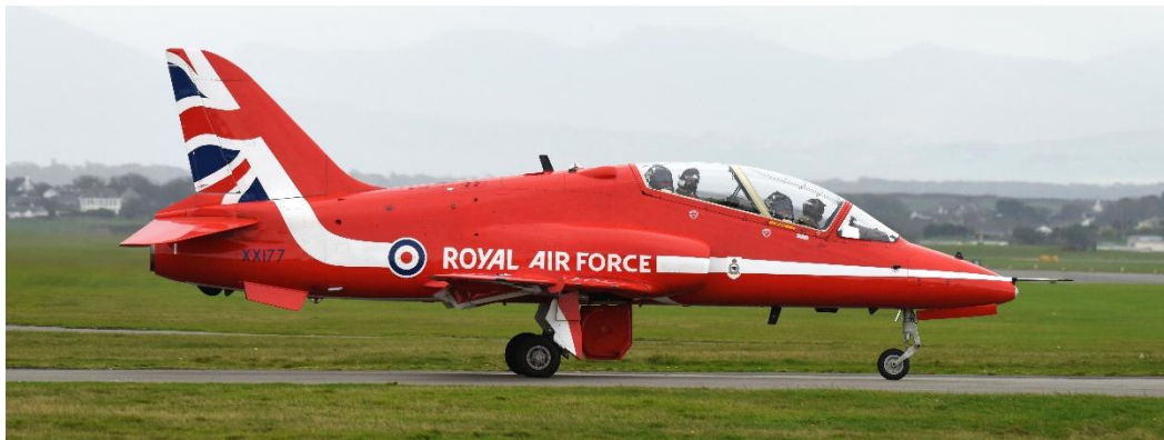
Hawk T.1 XX177 RAFAT 'RED10' air test 14:22-15:25 from ASP.1