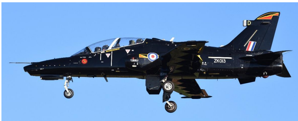
ZK013:D 'VYT15' air test.

Based noted flying: Hawk T.2 4/25 Sqn ZK011:B ZK012:C ZK013:D ZK018:I ZK019:J ZK020:K ZK021:L ZK025:FA ZK034:FJ ZK035:FK