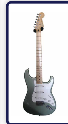
An electric guitar