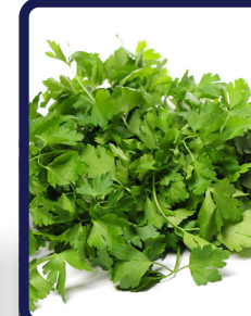
fresh parsley (a herb)