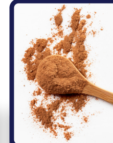
ground cinnamon (a spice)