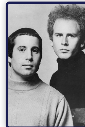
Simon and Garfunkel

People picking hops to make beer, like those described in the folk song 'Hopping Down in Kent'