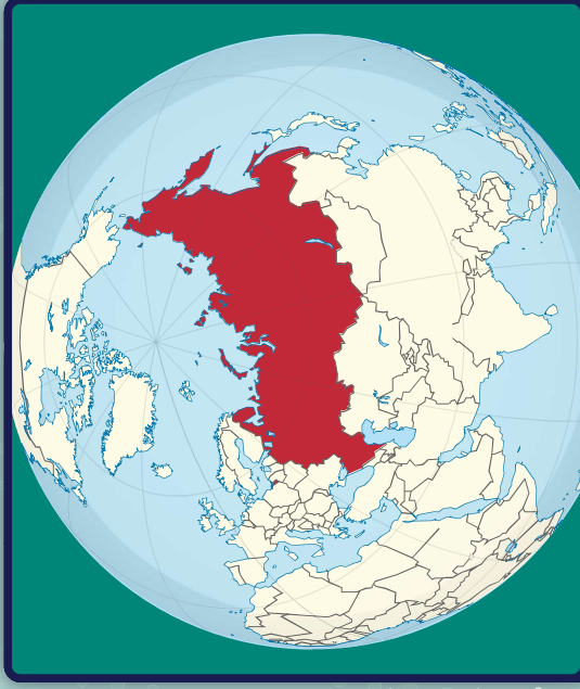
Mussorgsky was from Russia (pictured in red)

three-part musical form with an opening section (A), a following section (B) then repetition of the first section (A)