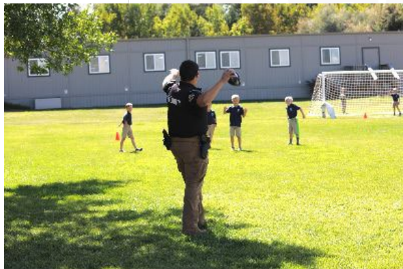
Our team throwing a football with K-5, nurturing trust, and open communication as key components of a safe environment.

When law enforcement agencies are stretched thin, the onus falls on private security to fill the gaps . Trained security professionals are a non-negotiable element in today's unpredictable landscape. These men and women serve on-site, around the clock, eliminating the long, risky wait for external help and implementing robust access control to keep unauthorized individuals at bay. As our article " The Deadly Consequences of Security Theater " elaborates, the cost of not having well-prepared security can be measured in human lives.