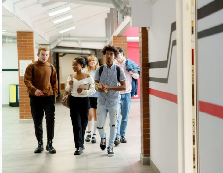
Kids gathered and walking in a High School Hallway believing they are safe from threats.

When it comes to active shooter scenarios in schools, every second counts. You've probably heard that a million times, but let's add a crucial context to it—a real-life event that turned out to be a devastating lesson for all of us. The Central Visual and Performing Arts High School in St. Louis is a case in point.