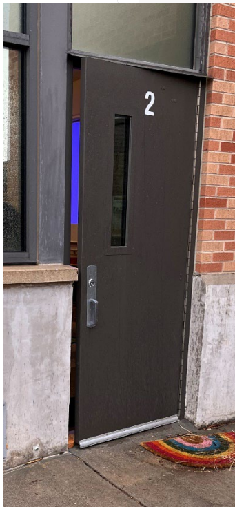
Propped door at a school in Boulder Area, Co

Our children's safety is in jeopardy , and the threat doesn't always come from the expected sources. The true danger lies in our complacency —a risk we can no longer tolerate. In Colorado, a state renowned for pioneering the playbook on active shooter response, complacency still manages to rear its ugly head. This complacency isn't born of mere forgetfulness or negligence; it's a pervasive, dangerous mindset of comfort that places our children's lives in jeopardy.