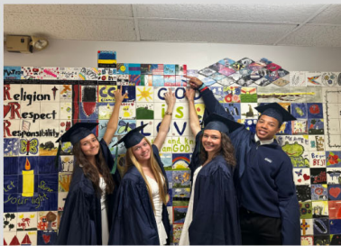
St. Regis Alumni Graduating from St. Michael The Archangel stopped by!