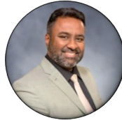
Coming to Dante June 8!