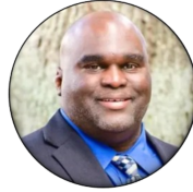
Coming to Dante June 8!