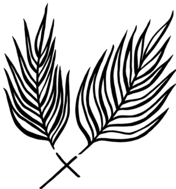
Worship Service Emmanuel Lutheran Church