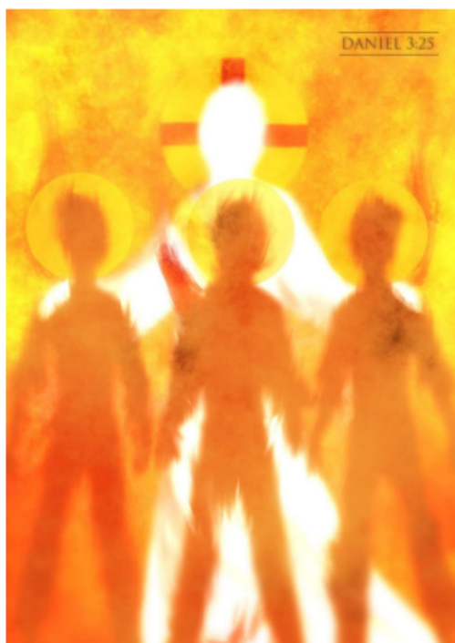
Worship Service Emmanuel Lutheran Church