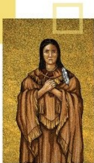
A mosaic of St. Kateri Tekakwitha is seen in the Trinity Dome at the Basilica of the National Shrine of the Immaculate Conception in Washington.

The French missionaries encouraged her to leave her hostile environment and travel to Canada to the St. Francois Xavier mission. Her uncle opposed this move, because he was suspicious of the French and feared it was a ruse to depopulate the village. Even so, Kateri prevailed and traveled the 200 miles by foot and canoe to Canada, where she lived a devout and exemplary life. Called the "Lily of the Mohawks," she is a symbol of chastity and purity as she sought to do penance to commit her life to God. When she died due to failing health, witnesses noted that her face was miraculously transformed so that all her smallpox scars disappeared. Over the years, people have asked Kateri for divine intercession when suffering from serious illnesses, and their prayers have been answered. Her legacy of healing continues. St. Kateri Tekakwitha was canonized on October 21, 2012.