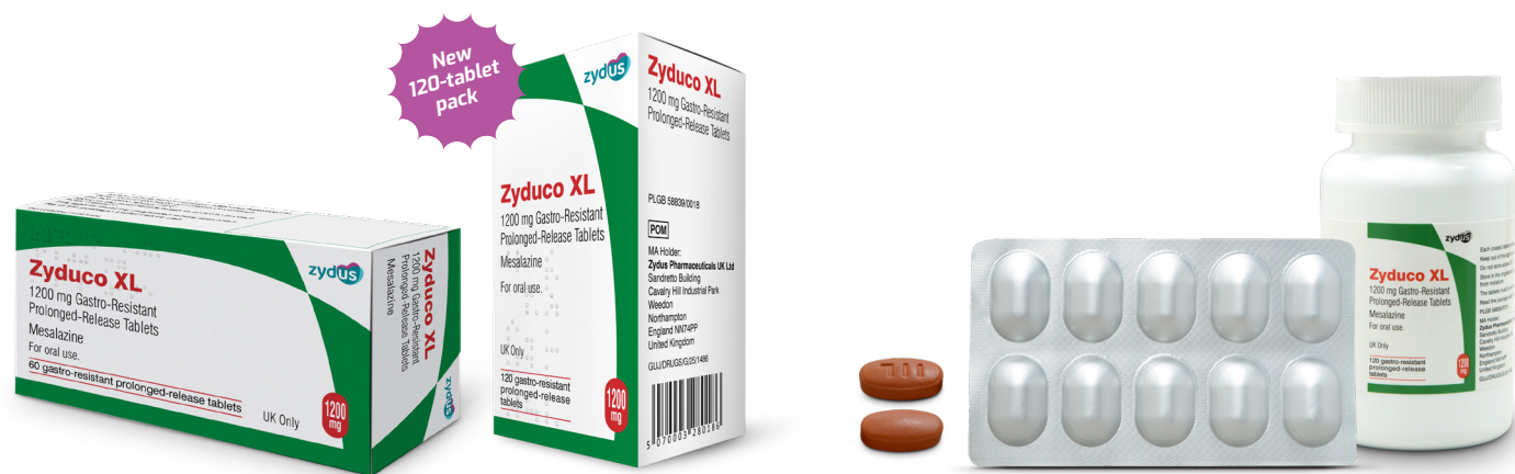
Not to size for illustration purposes only

Zyduco ® XL comes in two pack sizes: a 60-tablet Blister Pack and a 120-tablet Bottle Pack. It should be stored below 25°C, in its original packaging to protect from moisture, and has a 24-month shelf life 1 . The 120 tablet bottle can also help with the NHS net zero objectives, providing less waste and easier dispensing with a bigger pack 8 .