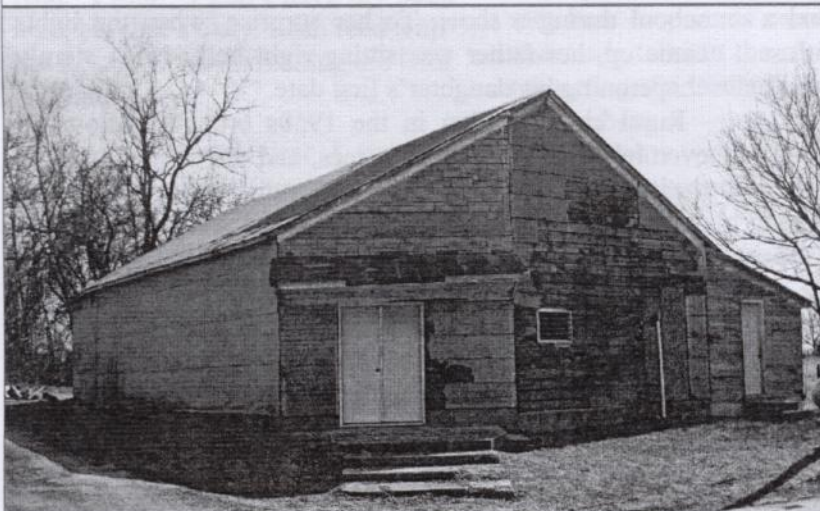
The building that once housed the Glass Theatre in Dora.