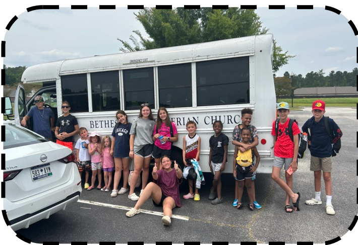
Hartsville Water Park trip