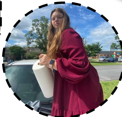
Summer Sunday School window washers