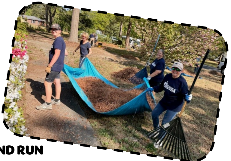
RAKE AND RUN