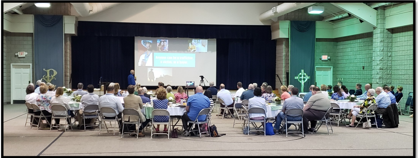
2026 ECO SPRING GATHERING