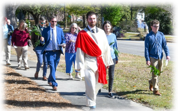
PALM SUNDAY PARADE