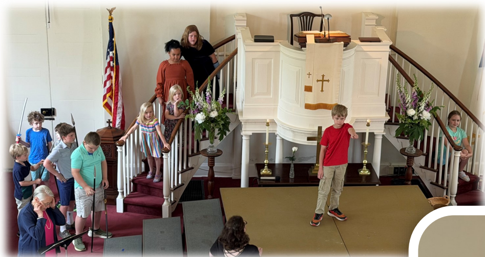
BETHESDA CHILDREN'S CHOIR