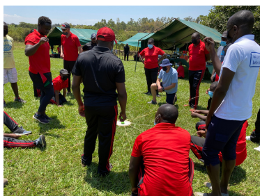
Staff compete in balancing water bottle challenge