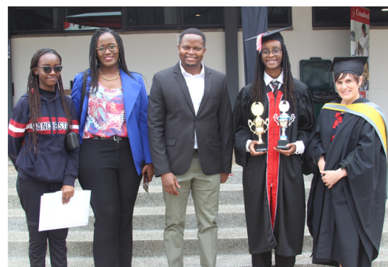
Parents join their children to celebrate their top achievement in the IGCSE Exams. What a proud moment for them!