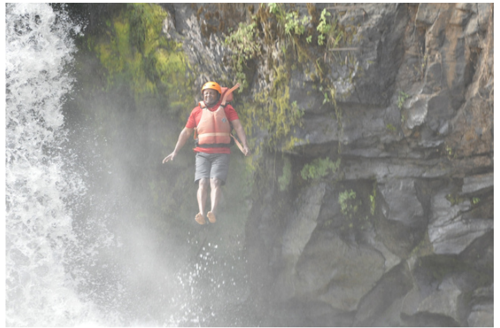
Mr. George flying down the cliff his eyes tightly shut his wish was if only he could turn back time"