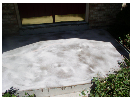
The final step is to apply the WOHL Concrete Color Stain to the surface.