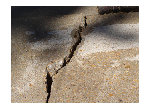
STEP 3 APPLICATION OF ShurBond 550 Epoxy Adhesive and ShurBond 100 Polymer Concrete to repair the surface. Rebuild expansion joints using high quality PolyUrethane Sealant.

The first picture on the left shows how the cracked slab in the picture above was repaired and brought up to level using ShurBond 550 Epoxy Adhesive and ShurBond 100 Polymer Concrete. Picture on the right also shows s severely spalled area and a crack repair. A build coat of ShurBond 100 Polymer Concrete was trowel applied over the badly etched area which was primed with ShurBond 550. The expansion joints have all been repaired.