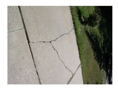
STEP 2 Clean the surface deep into the cracks and expansion joints. Using high pressure water blast the cracks are carefully cleaned. Actually done twice (first to just clean surface and cracks and then after grinding cracks etc.) We then us grinders and cutters to further clean the damage areas and prepare the surface for repair.