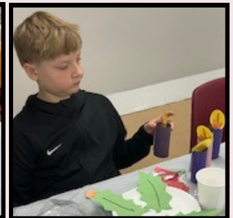
Young parishioners enjoy crafts and cookies in Friendship Hall during the December 7 PREP Advent activity.