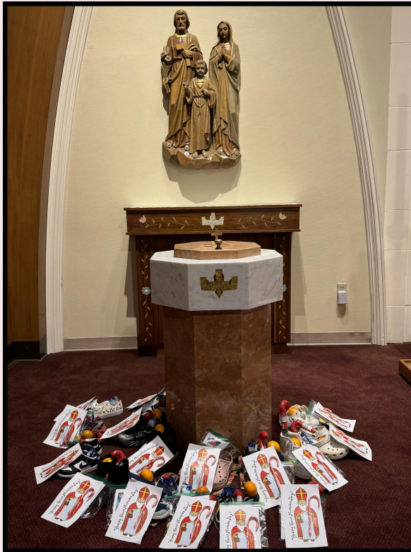
"St. Nicholas was here!"