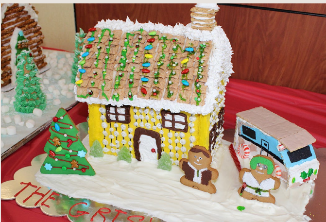
Laboratory: National Lampoon's Christmas Vacation

To help spark some Holiday joy and teamwork, the Foundation hosted a St. Luke's Gingerbread House Competition that included all hospital and outpatient departments. We were amazed at the creativity of all the departments!