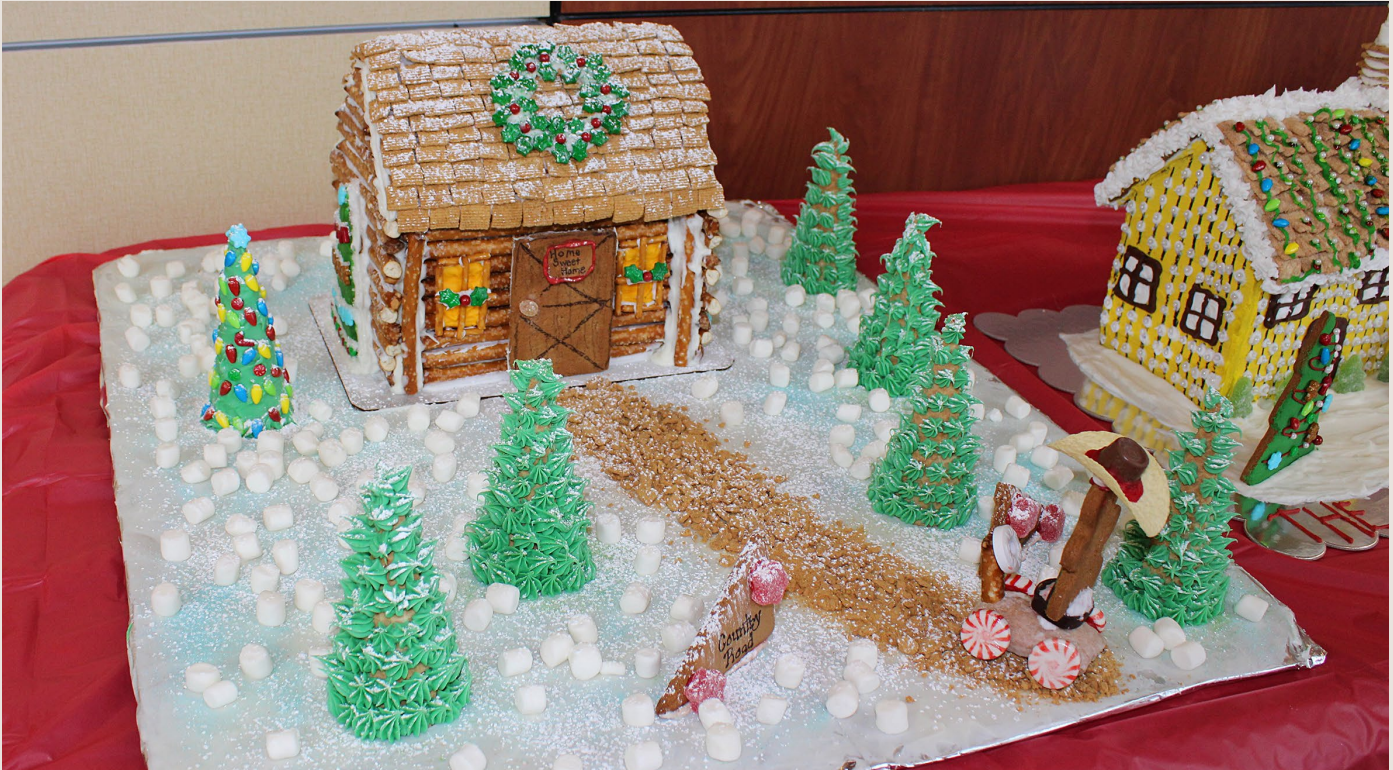
Respiratory Department: Country Road Take Me Home