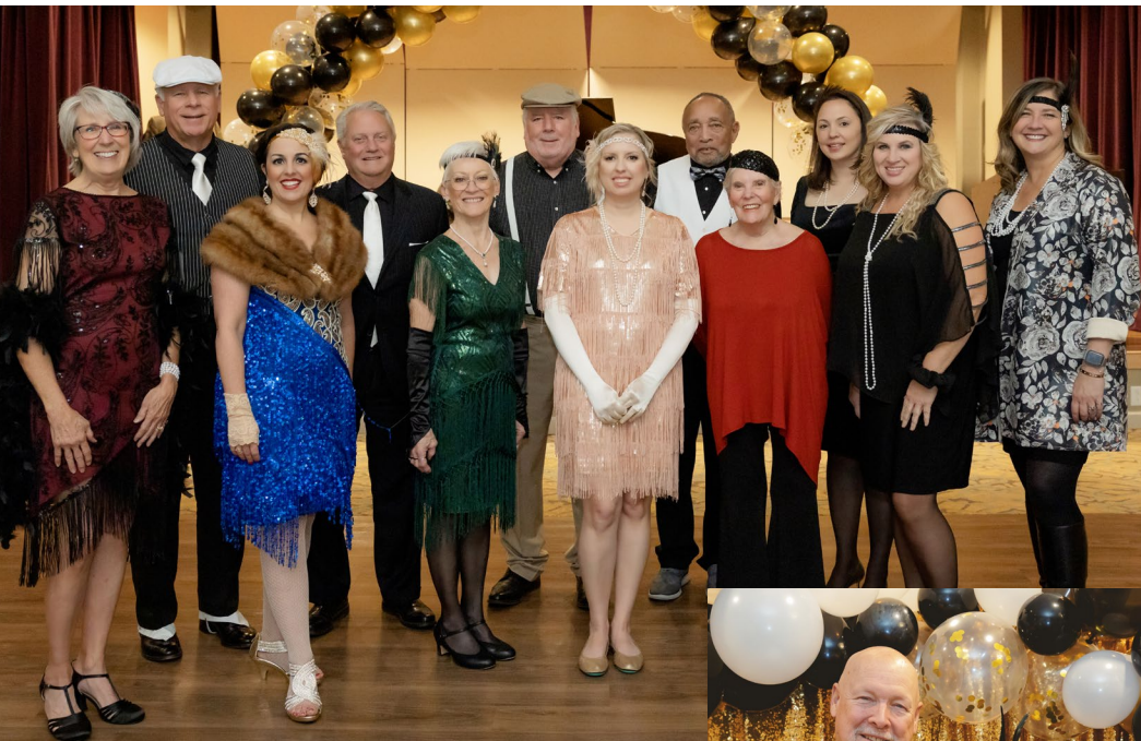
Foundation Board of Trustees