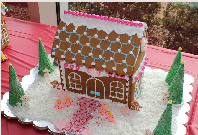
Med/Surg & ICU Night Shift: Pink Winter Wonderland