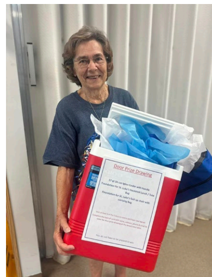
Door Prize Winner