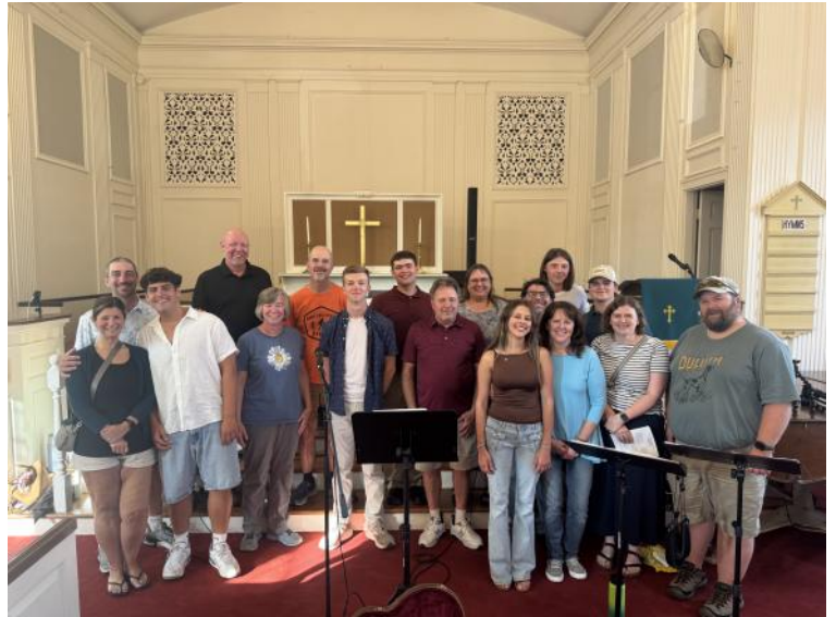
Band members with their proud parents.