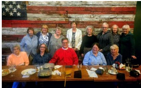
Dinner at the Blueprint Restaurant