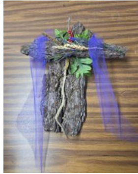
A Couple of Our Lenten Crosses