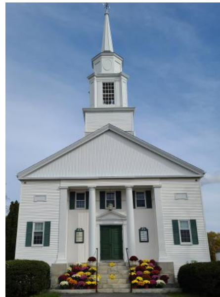
Annual mum sale is soon approaching. Watch for order forms coming soon.