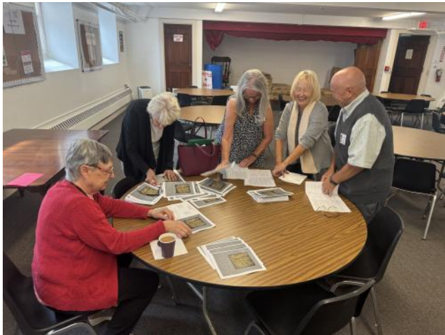
Volunteers folded concert programs