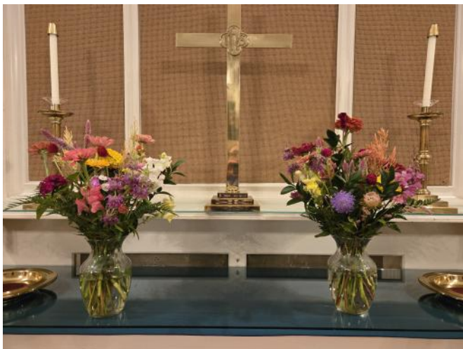
Women's Fellowship gathered flowers on Friday and arranged two altar bouquets for our September 7th worship service.