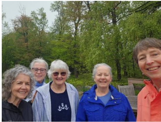
Doyle Community Park