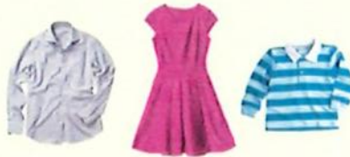
CLOTHING Men's, women's and children's

All items must be in good, clean, and sellable condition.