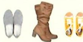
SHOES Men's, women's and children's