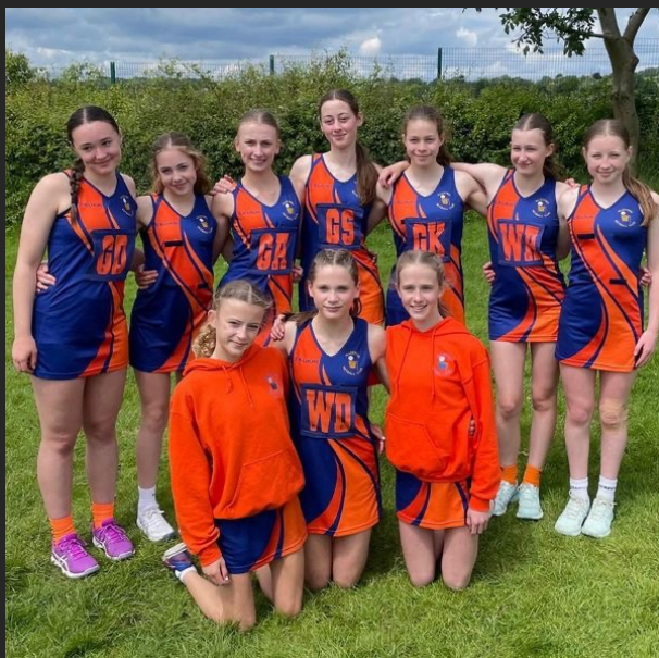
Allestree U14 Regional Qualifiers