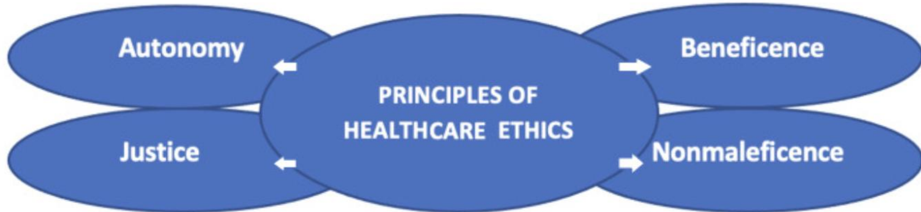
Figure 1. The four principles of healthcare ethics.