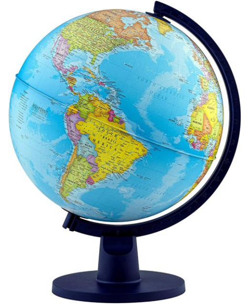
International Medical Graduate