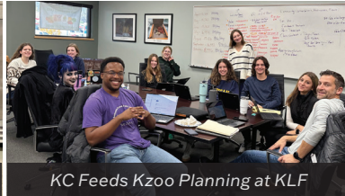
KC Feeds Kzoo Planning at KLF