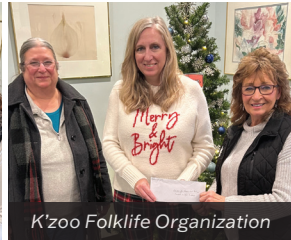
K'zoo Folklife Organization