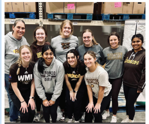
WMU Women's Golf Team