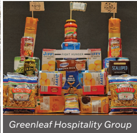
Greenleaf Hospitality Group