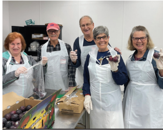
First Congregational Church