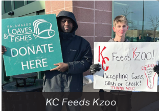
KC Feeds Kzoo