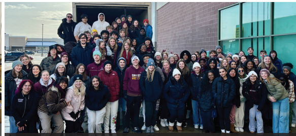
KC Feeds Kzoo at West Main Harding's