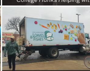
Picking Up Victorian Bakery Donations