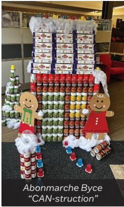
Abonmarche Byce "CAN-struction"