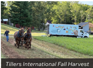
Tillers International Fall Harvest