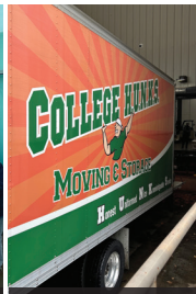
College Hunks Helping with Food Drive Pick Ups