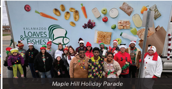
Maple Hill Holiday Parade