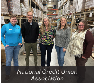
National Credit Union Association