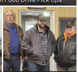
Kalamazoo County Farm Bureau Doe Derby