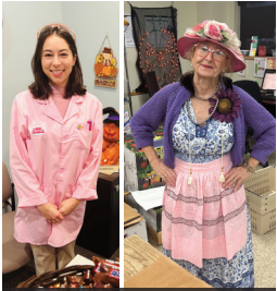
Volunteer Halloween Fun