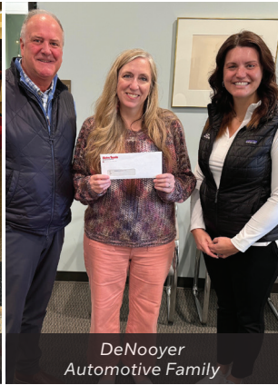
DeNooyer Automotive Family