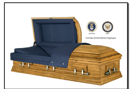
Allegiance II -twill interior (USMC or USA emblem) Allegiance - blue interior (USAF or USN emblem)

A valid DD-214 (Certificate of Release or Discharge from Active Duty) is required as proof of service. Only applicants with an Honorable or General (Under Honorable Conditions) discharge are eligible for this [discount/program/benefit].