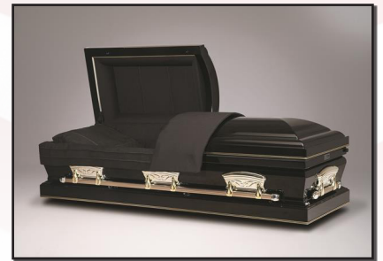
Patriot Ebony - twill interior