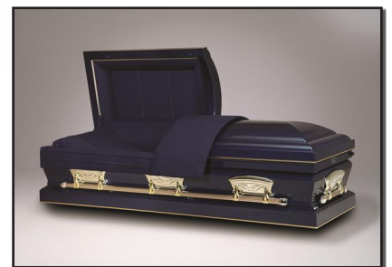
Freedom Midnight Blue - twill interior