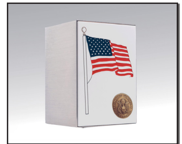
Flag Panel (Stainless or Bronze with branch of service medallion)

A valid DD-214 (Certificate of Release or Discharge from Active Duty) is required as proof of service. Only applicants with an Honorable or General (Under Honorable Conditions) discharge are eligible for this [discount/program/benefit].