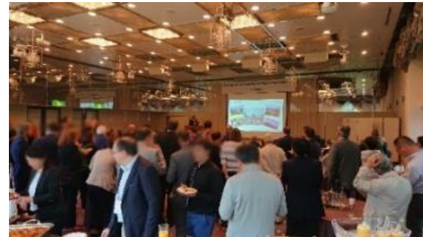
Reception onsite in 2019

Successfully organized in cooperation with EU-Japan Centre and with support from many European clusters, embassies and consulates. Here is the best place to explore business opportunities in Osaka, Kansai.