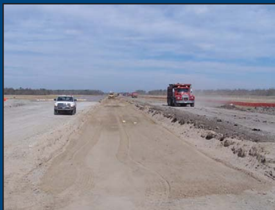
Runway Extension Construction

Shortly after the airfield acquisition in 2002, a Master Plan was produced to provide a clear view of the facility's future and its potential contributions to the region. Quick, short-term improvements have already been conducted to establish onsite security measures, fueling capabilities, and construction of a hangar for aircraft storage.