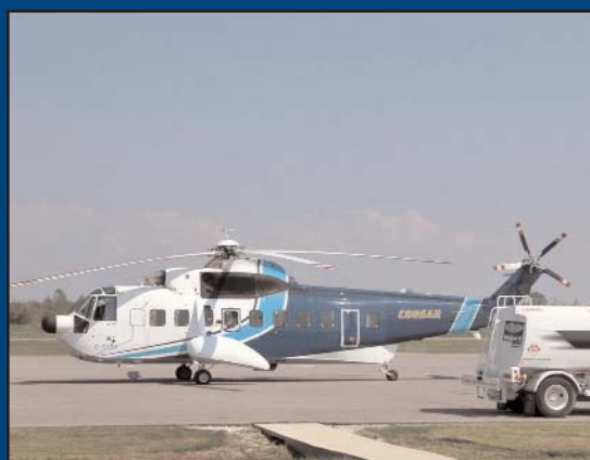
Aircraft at South Lafourche Airport