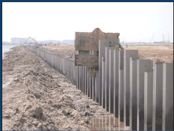
Northern Expansion Construction

At the conclusion of the construction to the Northern Expansion, dredging will take place and the dredged material will be used to rebuild and extend the Maritime Forest Ridge.