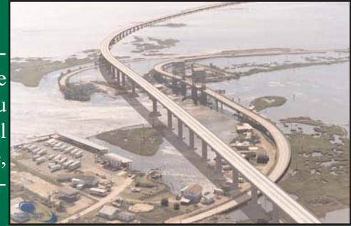
Above is the proposed elevated highway. $141,000,000 bid on the approaches has recently been awarded.

Phase 1 of the LA 1 project consists of three sections; the approaches to the Bayou Lafourche crossing, the actual bridge over Bayou Lafourche, and the 6.2 mile elevated roadway from southern Leeville to Port Fourchon.