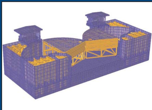
Above is a computer generated image of the new Golden Meadow Locks

Picciola & Associates, the project’s design engineers, gave an estimated completion date of December 2007. The total projected cost of the project is $15 million.