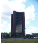
New Haven, CT