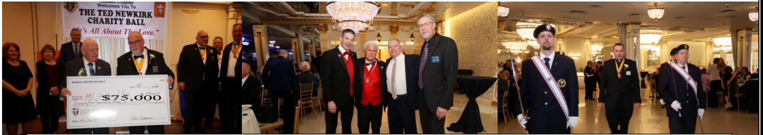
The Nassau Chapter of the K of C presented $75,000 to the AMT Children of Hope on April 11th

April 11 th , 2026 Leonard's Palazzo of Great Neck