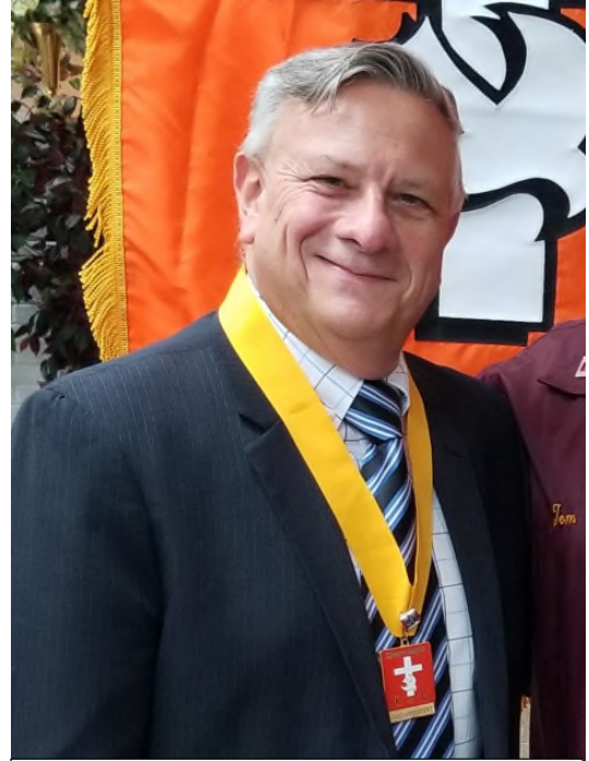
Conference Warden and Nassau Chapter Scholarship Chairman