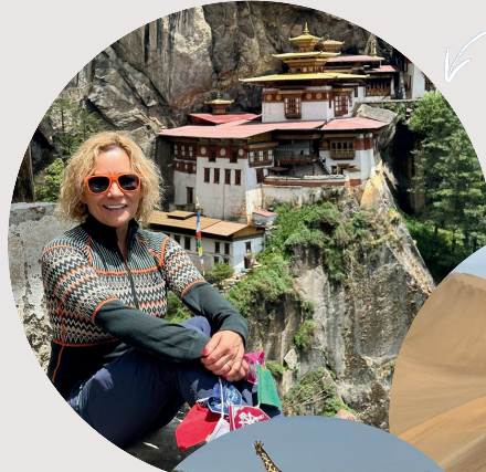
Tiger's Nest, Bhutan