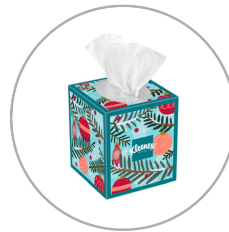
3 boxes of Kleenex tissues