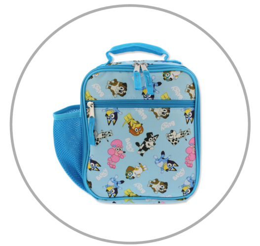
1 soft sided lunch box**

Parents must provide diapers/ pull-ups and wipes by their child's first day. These items will need to be replenished as needed throughout the year.