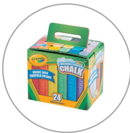
1 pack sidewalk chalk