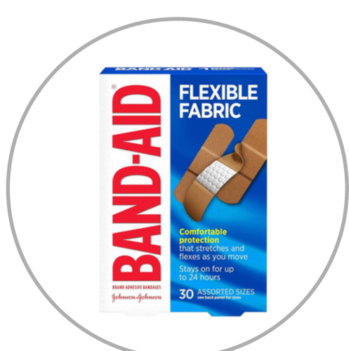
1 box of band-aids