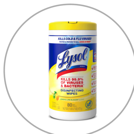
1 container of Lysol Wipes