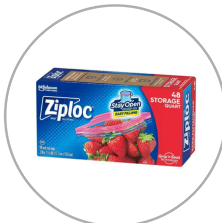
1 box quart-size Ziploc bags