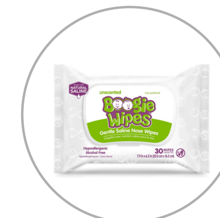
2 packs Boogie Wipes

The following items are specific to your child only. They must be labeled with their full first and last name.