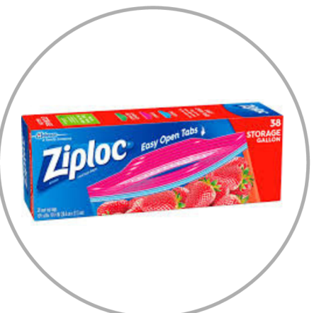
2 boxes gallon-size Ziploc bags