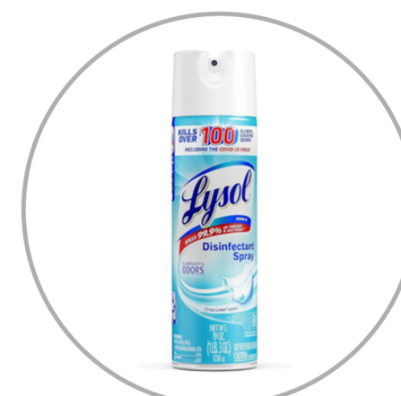
1 can Lysol disinfectant spray