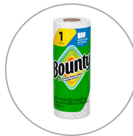
2 paper towel rolls