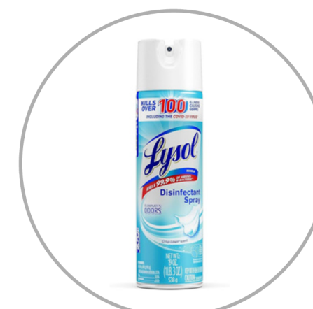
1 can Lysol disinfectant spray