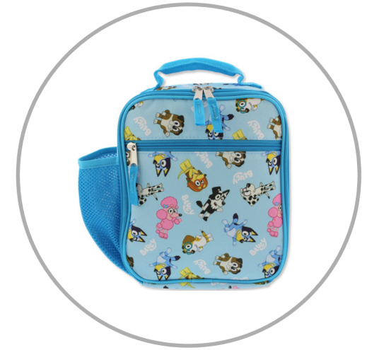
1 soft sided lunch box**

Parents must provide diapers/ pull-ups and wipes by their child's first day. These items will need to be replenished as needed throughout the year.