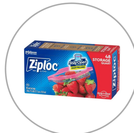
1 box quart-size Ziploc bags