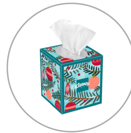
3 boxes of Kleenex tissues