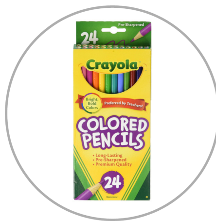
1 24-pack colored pencils