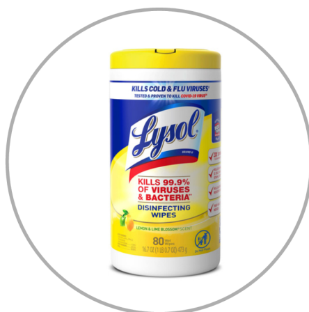
1 container of Lysol Wipes