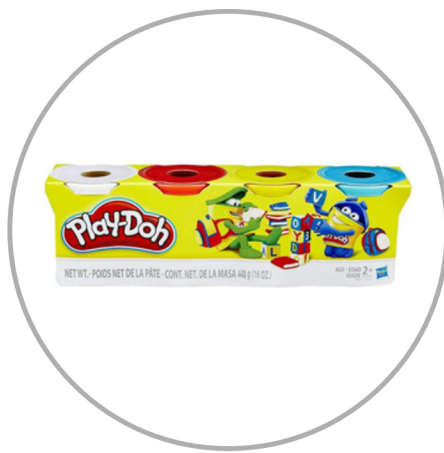
1 4-count pack of Play-Doh

The supplies listed below are for whole class use during the school year.