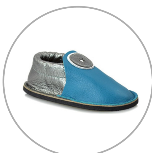
1 pair of indoor shoes (see link below)