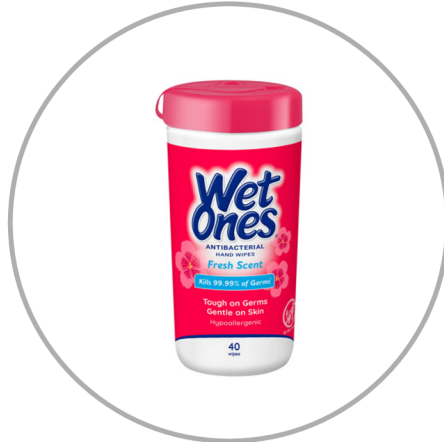
2 containers of Wet Ones Wipes