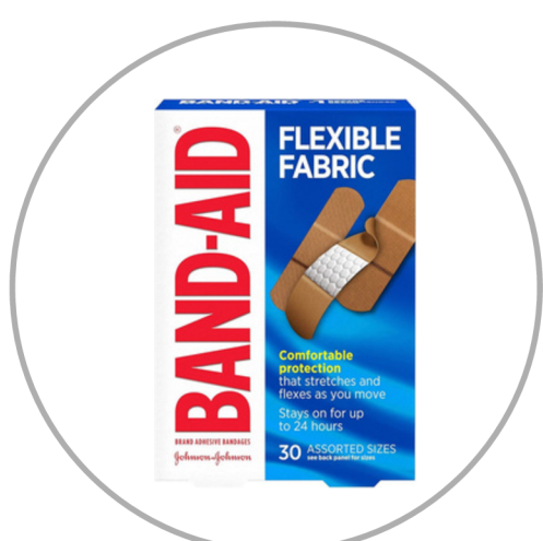
1 box of band-aids