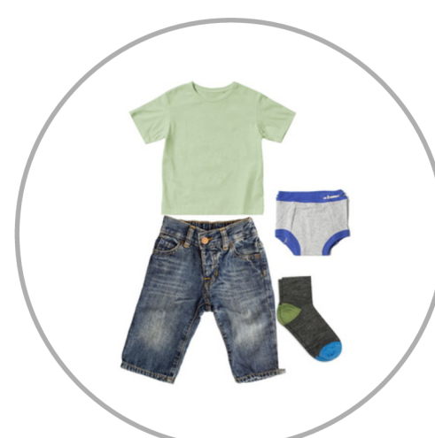
Full change of clothes