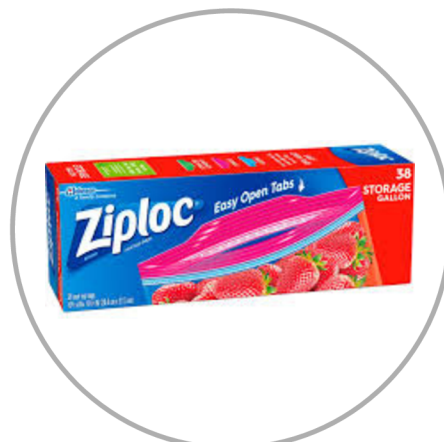
2 boxes gallon-size Ziploc bags