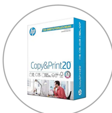
1 pack of white printer paper