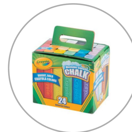
1 pack sidewalk chalk

The following items are specific to your child only. They must be labeled with their full first and last name.