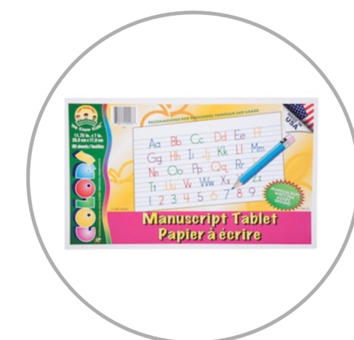
1 double-ruled handwriting tablet