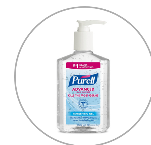
1 bottle of hand sanitizer

The following items are specific to your child only. They must be labeled with their full first and last name.