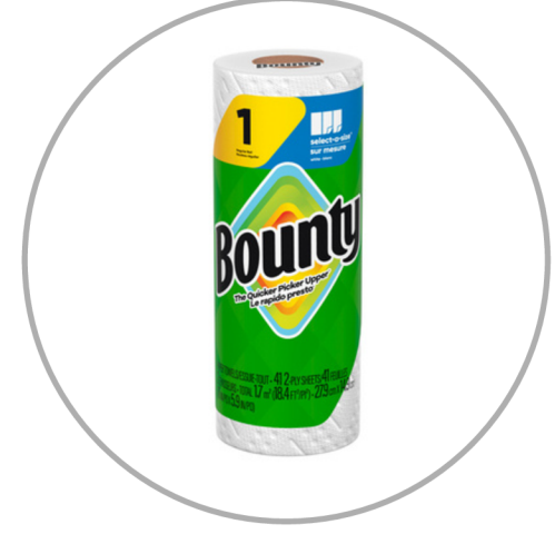
2 paper towel rolls