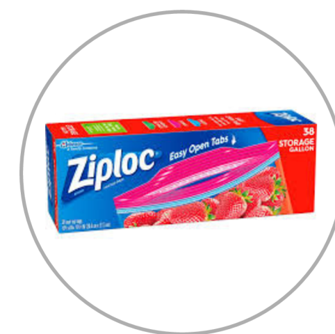
2 boxes gallon- size Ziploc bags