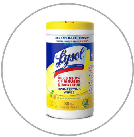
1 container of Lysol Wipes