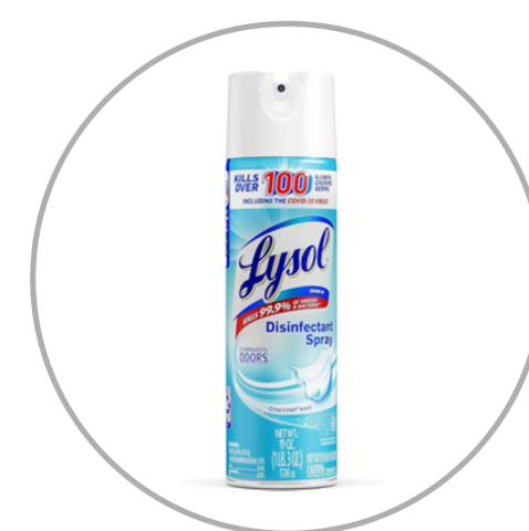
1 can Lysol disinfectant spray