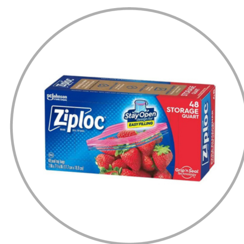
1 box quart-size Ziploc bags