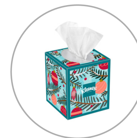
3 boxes of Kleenex tissues