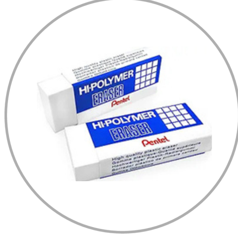
2 large, white pencil erasers