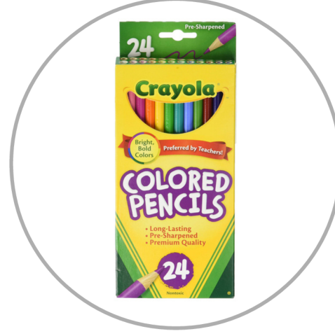
1 24-pack colored cencils