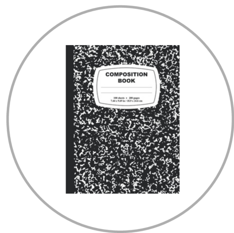
1 composition book ( 4 year old+ only ).