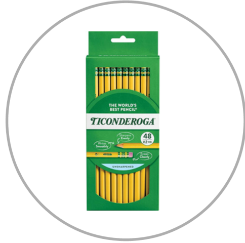
1 pack #2 pencils

The supplies listed below are for whole class use during the school year.