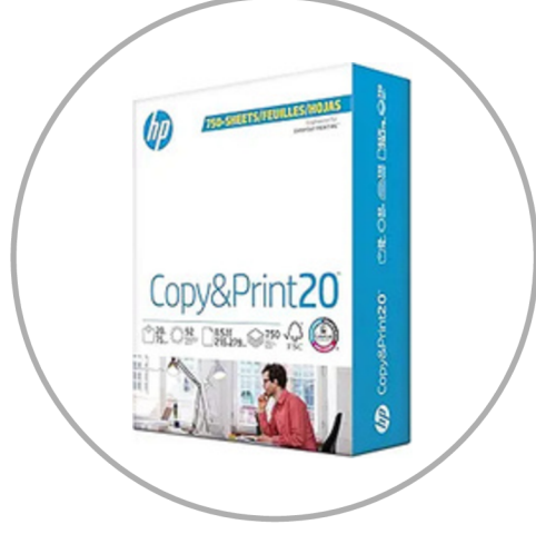
1 pack of white printer paper