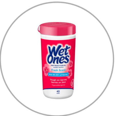
2 containers of Wet Ones Wipes