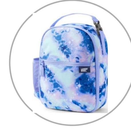
1 soft sided lunch box*