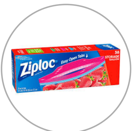
1 box gallon- size Ziploc bags