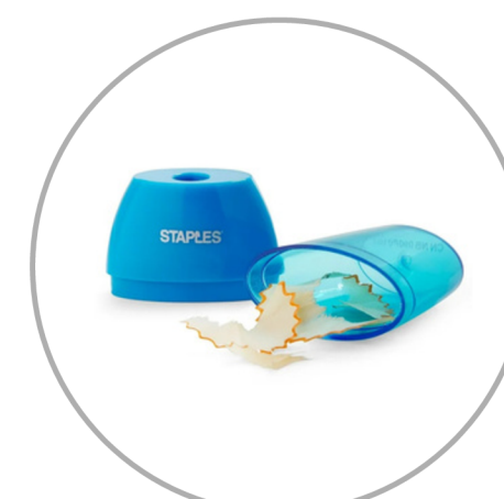
1 manual pencil sharpener