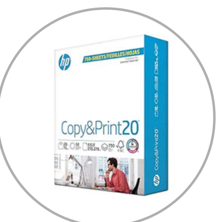
1 pack white printer paper