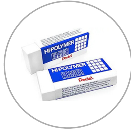
2 large, white pencil erasers