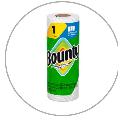
2 paper towel rolls