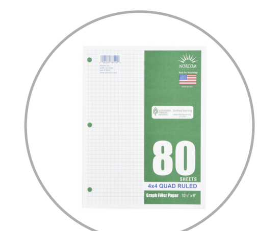
1 pack graph paper (*3 rd grade only)