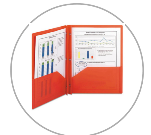
2 3-prong pocket folders