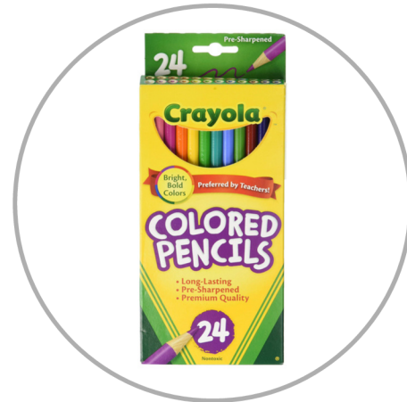
1 24-pack colored pencils