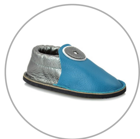
1 pair of indoor shoes (see link below)