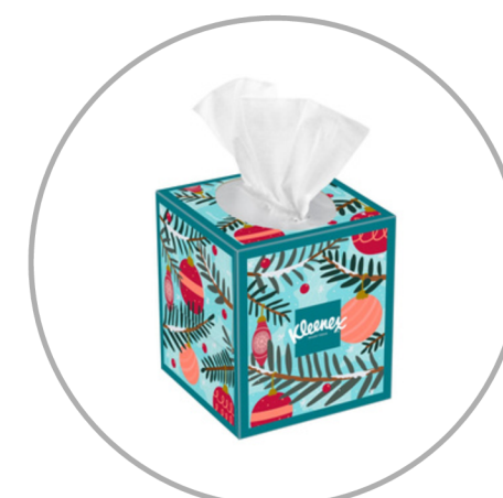
3 boxes of Kleenex tissues