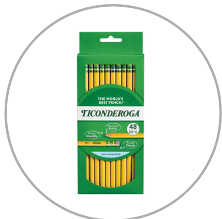
1 pack #2 pencils

The supplies listed below are for whole class use during the school year.