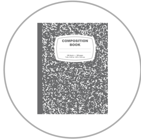
5 composition books