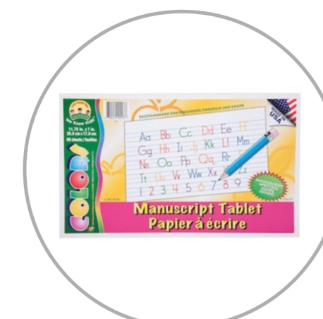
1 double-ruled handwriting tablet