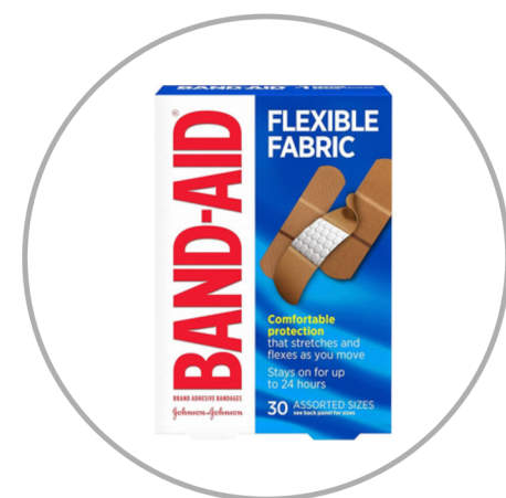
1 box of band- aids

The following items are specific to your child only. They must be labeled with their full first and last name.