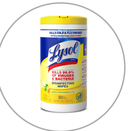
1 container Lysol wipes