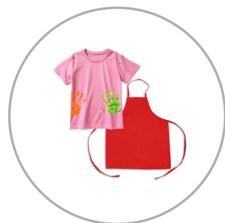
Paint shirt or kid's craft apron