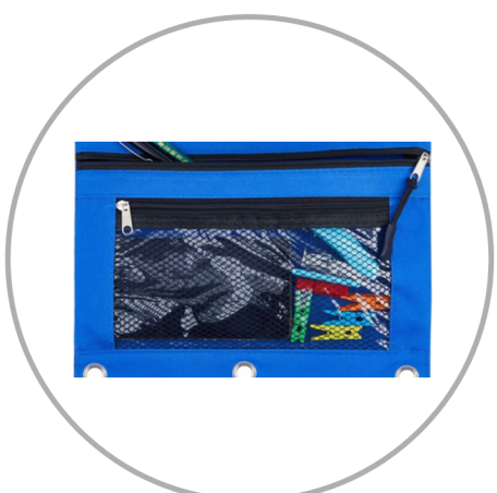
1 3-ring pencil pouch