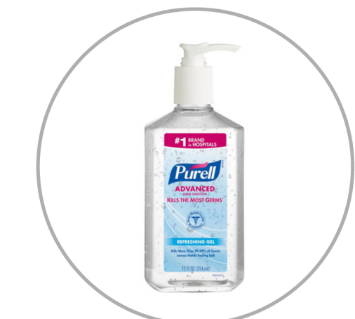
1 bottle hand sanitizer

The following items are specific to your child only. They must be labeled with their full first and last name.