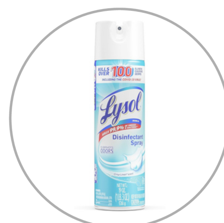
1 can Lysol disinfectant spray