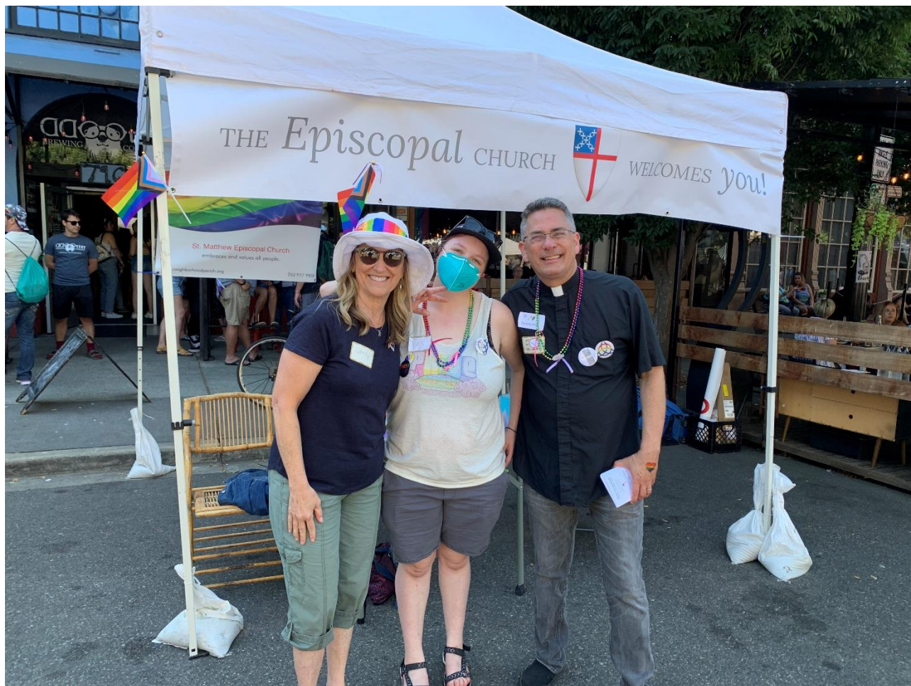
Episcopalians at Tacoma Pride 2023

We give not to "pay for the show," but as a spiritual practice of participation for the good of the world and of our souls. The Church of the Good Shepherd is able to operate because of the pledges of its members. We strongly encourage all members to make an annual pledge, no matter how large or small. To make a pledge today for 2026 , use the pledge card found in your pew or go to https://tinyurl.com/pledgegoodshep2026 .