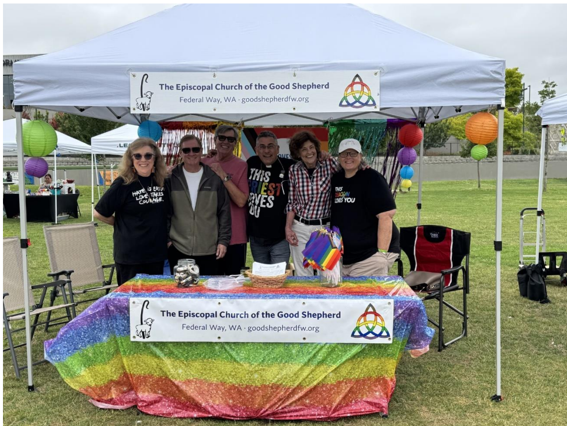
Good Shepherd booth at Federal Way Pride 2025