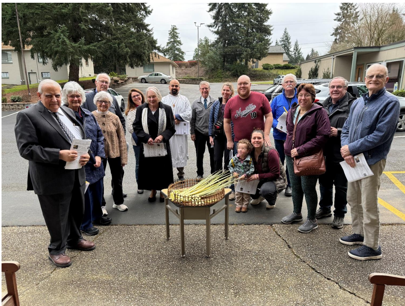
Our 8:00 congregation on Palm Sunday, two weeks ago.