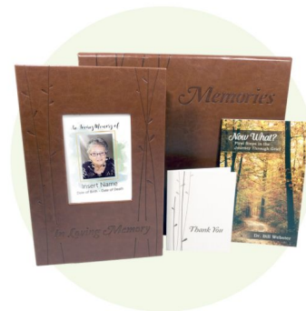
Stationery Box Set