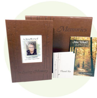
Stationery Box Set